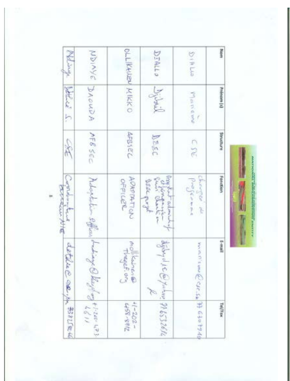
ANNEX 3: List of participants to the workshop on direct access