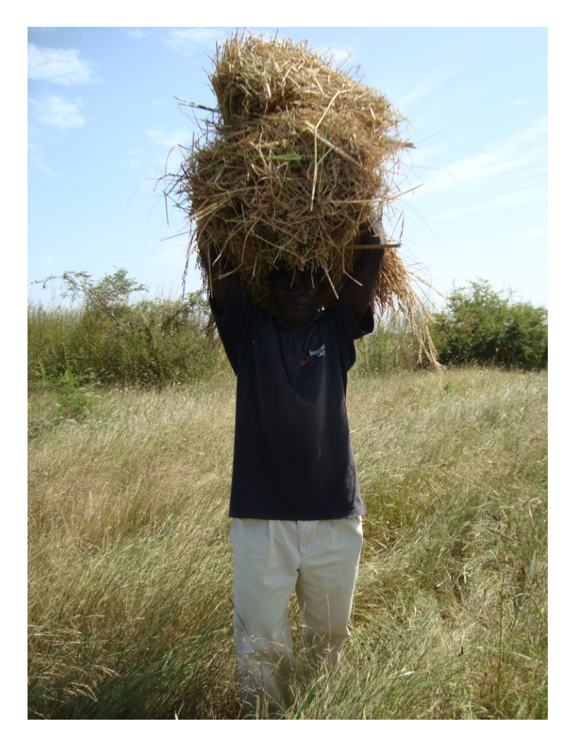
Figure 4: A beneficiary carrying rice bundle following first harvest as a consequence of the building of the anti-salt dyke

How was the cost effectiveness of the programme options assessed? During implementation, did these assessments turn out to be accurate?