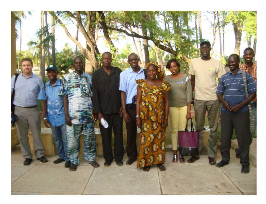
Figure 2: Visit of the mission to the headquarters of the executing entity Dynamique Femmes , in Joal.

process since the beginning, which, according to them, was not usually the case for projects implemented in the past, in their jurisdiction. According to them, their involvement at the earliest possible could help avoid many social conflicts, especially on issues related to land tenure. Furthermore, the prefect of Mbour, one of the targeted districts, told the mission that he was receiving execution reports from the programme team.