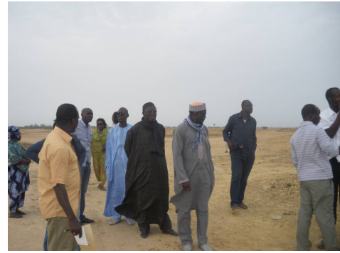
Figure 5: Identification of the old dike's alignment