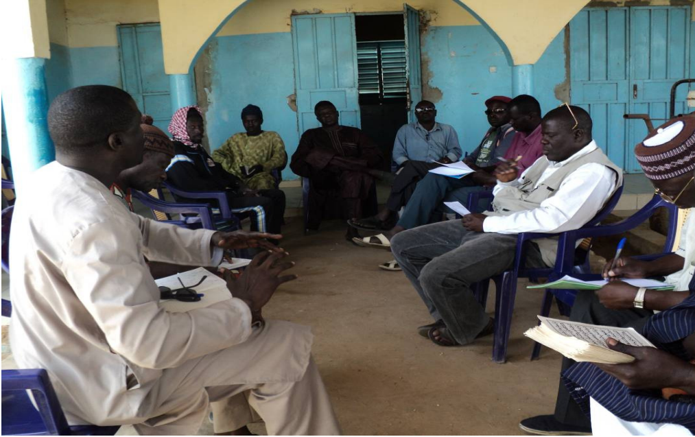
Figure 4 : Advocacy event with fishery stakeholders (Inter-professional EIG)