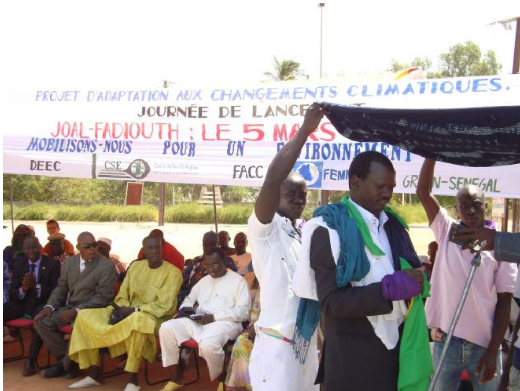
Figure 3 : Launch of the project at local level with the Mayor of Joal