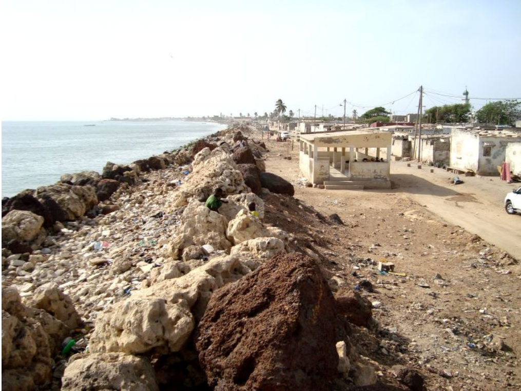
Figure 2 : A rudimentary structure to protect the district against sea water encroachment