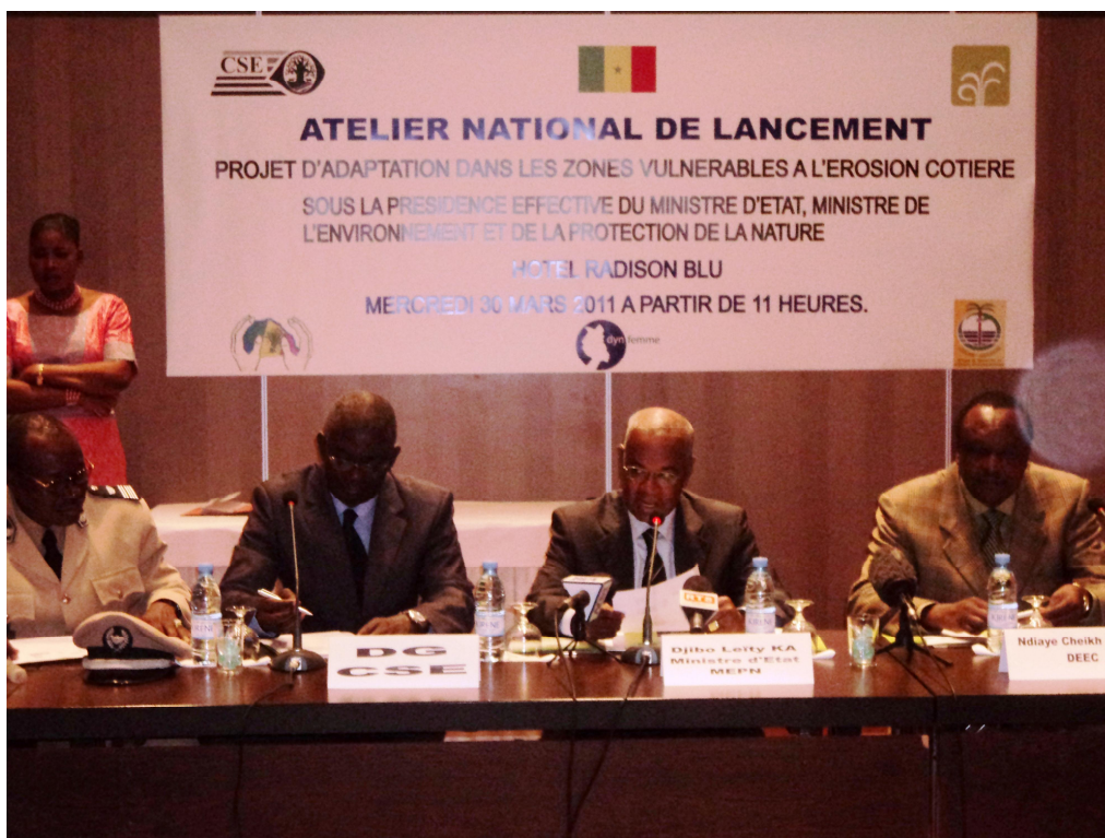
Figure 1 : National launch of the project by the Minister of Environment