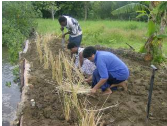
Construction of river bank protection structures using local materials, and planting of vetiver grass for bank stabilization (Buretu, Fiji – USP CBA project)

Output 2.3 Climate-resilient agriculture and forestry management practices are implemented