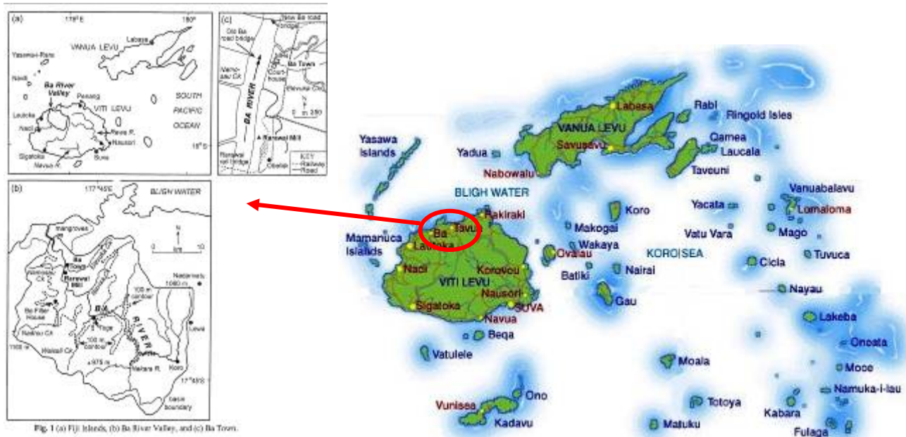
Figure: Map of Fiji and the Ba Catchment