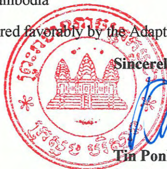
Tin Ponlok Secretary of State