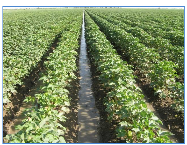
Cotton growth in irrigation oasis of Sakarchaga