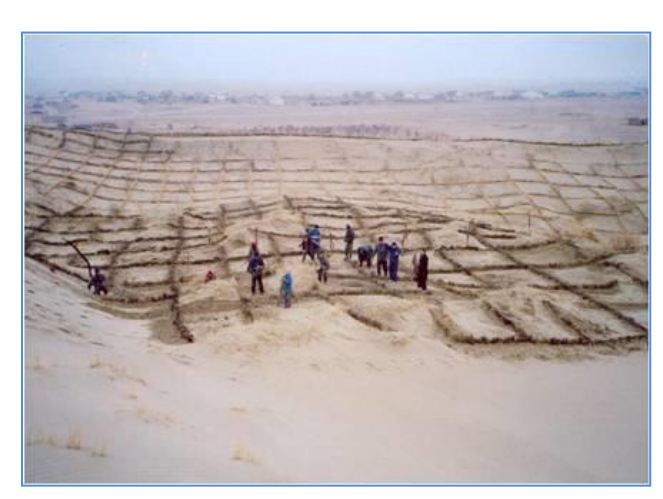
Dune fixation with reed cells in desert region of Garagum