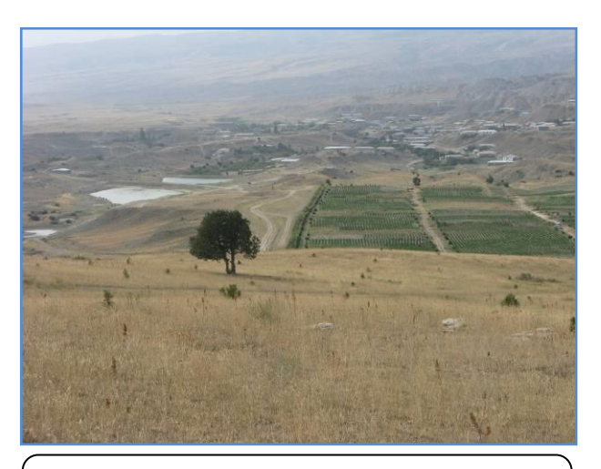
Water reservoirs and irrigated land in mountainous Nohur region