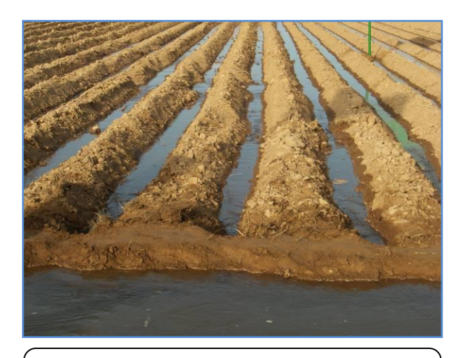
Irrigation of agriculture land in oasis region of Sakarchaga