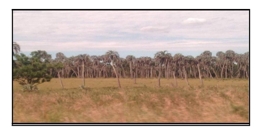
Photo 8: El Palmar National Park, December 2017.

There are exchange activities between El Palmar National Park (Argentina) and Esteros de Farrapos e Islas del Uruguay Protected Area (Uruguay) and the intention of a formal agreement between Argentina's National Parks Administration (APN) and MVOTMA – SNAP from Uruguay.