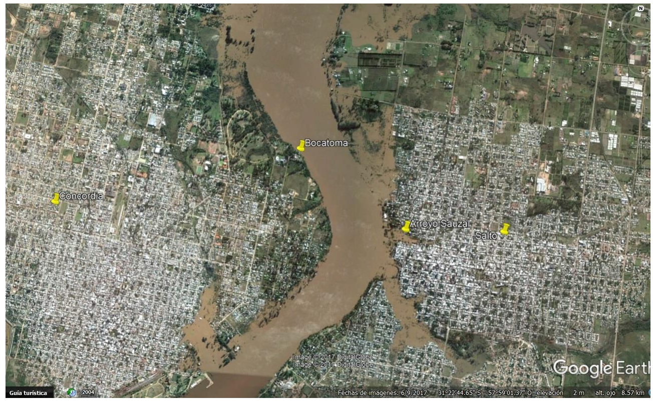
Photo 1: Concordia (Argetnina) – Bocatoma's City Affected (Water Input for City Affected) – Santo (Uruguay) Urban pattern modified by floods in Arroyo Sauzal in Salto City. September 2017

30. Through an environmental assessment in Concordia city, the deterioration of services infrastructure (sewage, potable water, among others), as well as a critical relationship between urban and natural areas due to an inadequate waste management have been determined along with the careless management of streams, Uruguay river's riverside, coastal erosion processes and the challenges for evacuating water excess. In this framework coastal protection measures are proposed were the water intake and water treatment plant for the whole city are located (152.282 people in 2010). There is a permanent severe erosion process in this area which is exacerbated with every Uruguay river's overflow.