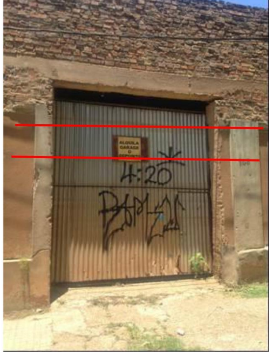
Photo 3: Salto (Uruguay) – Red line shows inundation level). Visit December 2017.