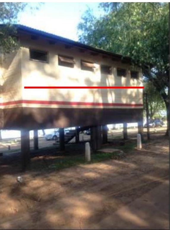
Photo 5: Colón (Argentina) – Red line shows inundation level). Visit December 2017.