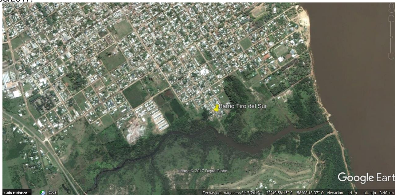
Photo 4: City of Colón (Argentina) - Tiro sur Neighborhood impacted by flooding.