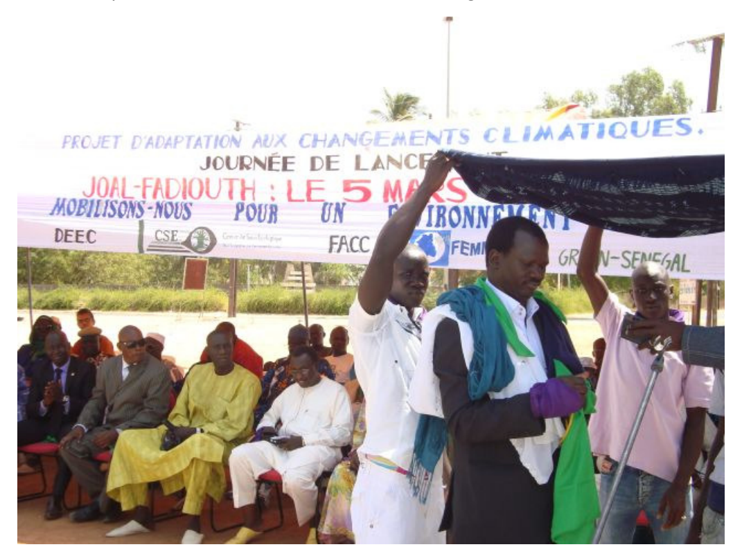
Figure 3 : Launch of the project at local level with the Mayor of Joal