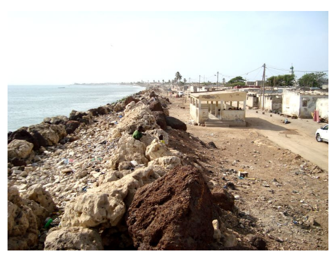
Figure 2 : A rudimentary structure to protect the district against sea water encroachment