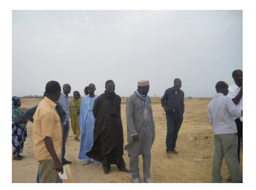
Figure 5: Identification of the old dike's alignment