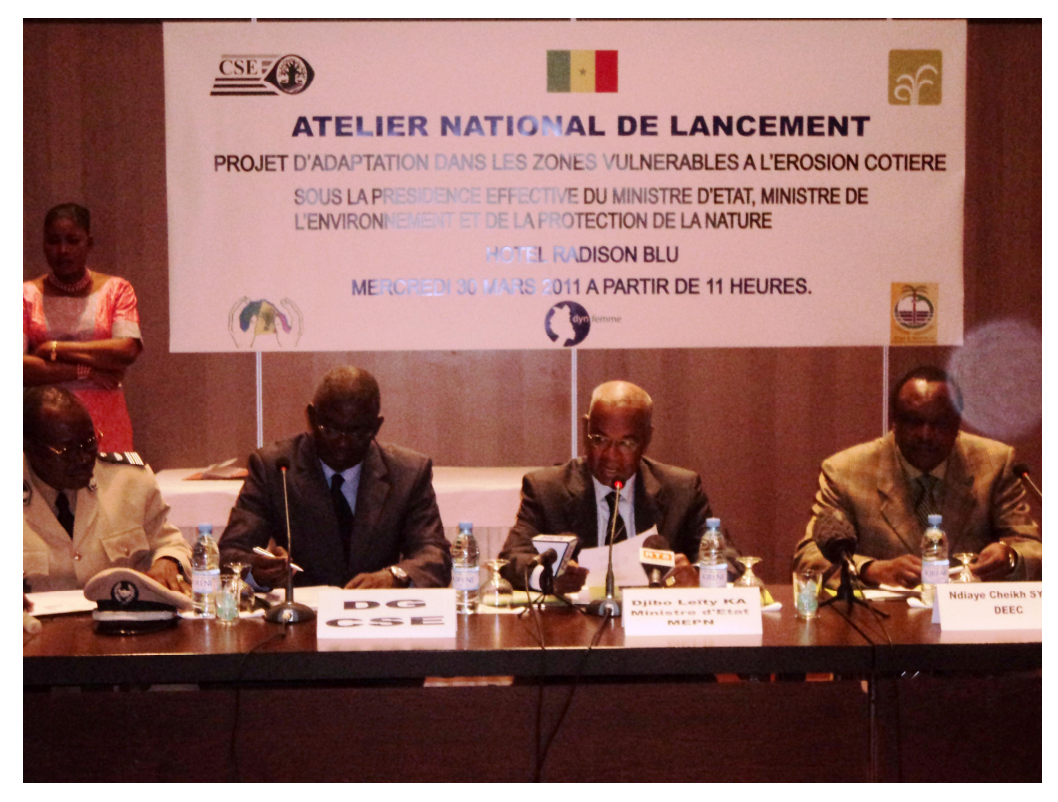
Figure 1 : National launch of the project by the Minister of Environment