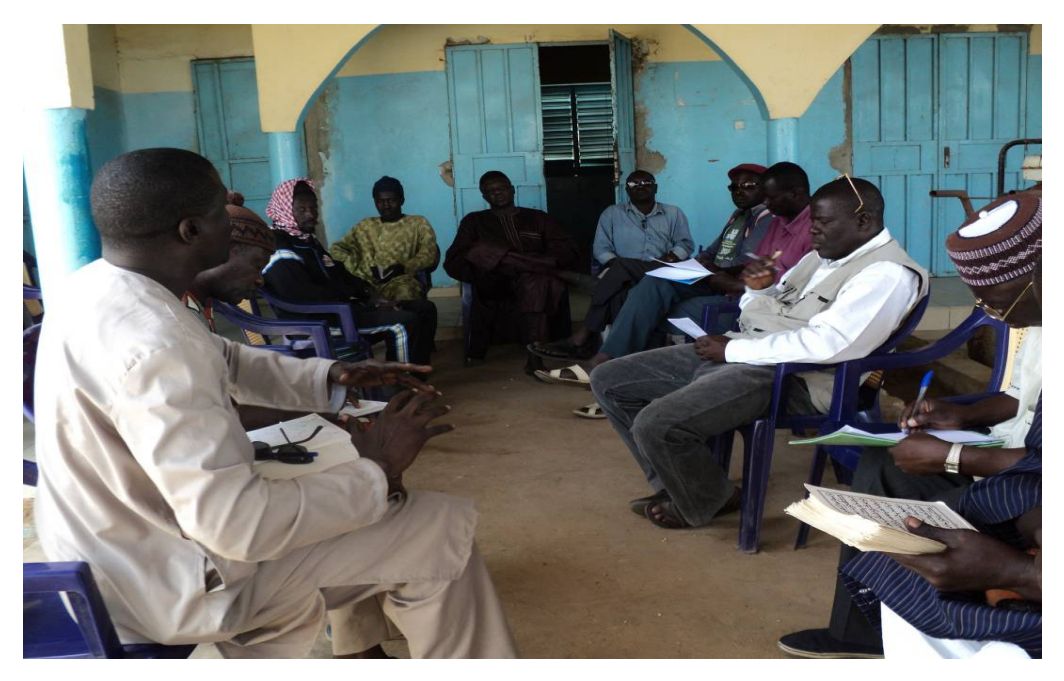
Figure 4 : Advocacy event with fishery stakeholders (Inter-professional EIG)