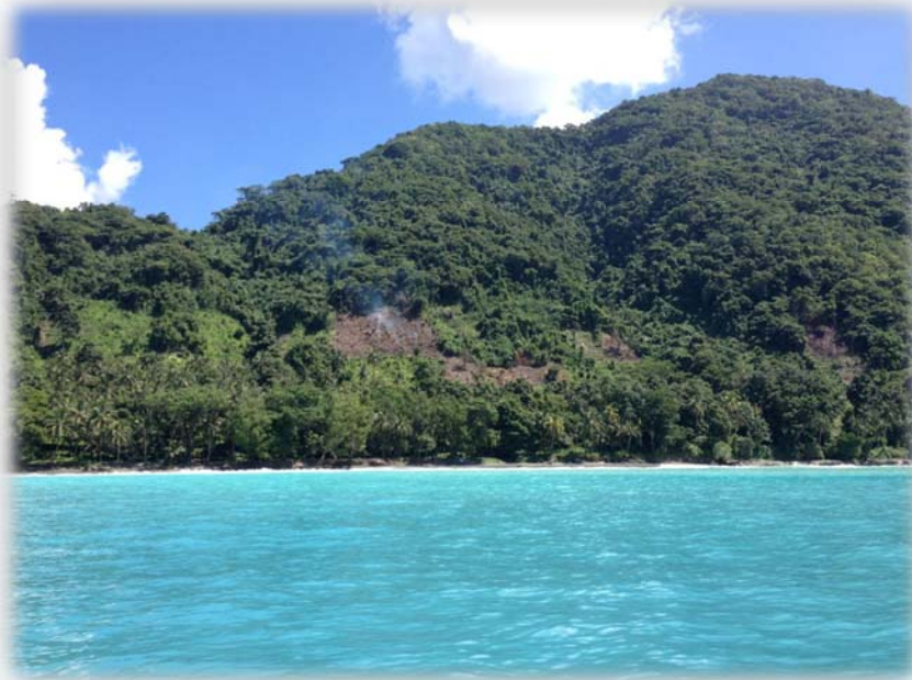
Pic.: 5 Typical agricultural area in the Solomon Islands, this garden had a slope of 43 degrees

According to the interviews held, the majority of the people in the communities are capable of producing extra crops/fish/crab/fruits etc to sale at the local markets, although in very small quantities as they do not make much effort to produce in bulk due to the limited access to the market and the cost and the time involved. Most of the people talked to, expressed similar views that they, would be happy to produce more if there is access to markets at a cheaper cost and less time involved.