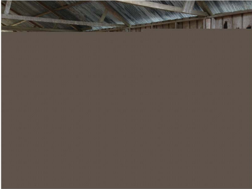
Pic.: 1 Community discussion about SWoCK with Jennifer Tugunau MTE Local Consultant in Isabel Province

There is however a good potential for using the participating villages in the future for other project activities, especially in training and capacity building. Gender mainstreaming is an important issue in UNDP context; although in the SI gender issues are not so relevant then in other developing countries. Positive aspects are the good relations with SWoCK and the women groups in the villages.