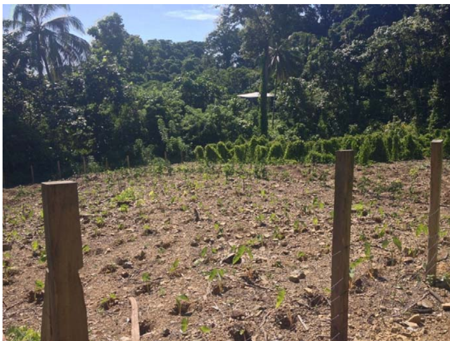
Pic.: 12 Good practice at the nursery of plantings at the Weather coast of Guadalcanal