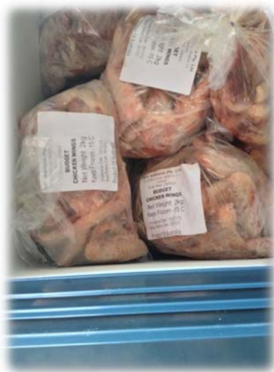
Pic.:4. Budget chicken wing from Australia, in a shop in Auki, while farmers are complaining about access to markets. The importation of cheap chicken from overseas has put pressure on local farmers with high production costs.

There is tendency increase in food security during “normal times” but not during any disaster periods, when the transportation of supplies to villages are impossible due to rough seas or inaccessible land transport putting the communities at a higher risk. Nutrition and health issues are other areas to be considered, which is way out of the scope of this report but needs to be considered. It is very important in any food production that the food produce provide a nutritional balance meal.