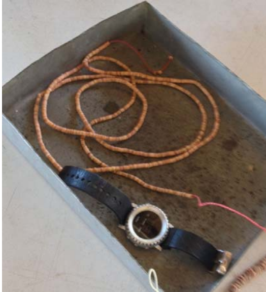
Pic.: 6 Shell money – this piece is worth 150 SBD, which is a cost of a good dinner in a fancy restaurant in Honiara (watch for sizing) or a cheap school fee. People can buy 20kg bags of root crops and 2 med yellow fin tuna from the local market with the same

To maintain a sustainable healthy food security, food must be, produced locally with local and regional cooperation. To achieve such outcome, the yields of crops have to be increased. As a result of a high yield production and a connection to a market, it reduces the work and time input into production and the need to find a market for the surpluses. Whatever agricultural activities the communities are involved in food crops or livestock, surpluses should provide some revenue. This balances the need to maintain their access to healthy food and the need to meet other commitments financially.