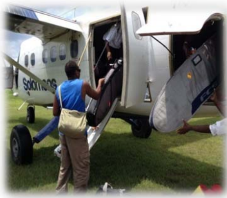
Pic.: 7 Surfers are regular tourists who are staying for longer periods in villages and they tend to return.