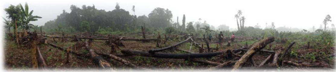
Pic.: 11 SWoCK Project site in Isabel, Trial of different varieties of crops without labeling, without clearing the area from tree trunks without pest management etc.

It is important to point out that there is quite a large number of mis-managed activities due to lack of technical support in the project. The MTE Team have seen that most of the activities already on the ground are done without any proper documentation in place or little or no input from technical officers from the ministries. This is in terms of outlining the processes and skills involved as well as technical input from the relevant service providers. Some examples: (i) GIS training has been conducted, although none of the 40 participants whom attended uses GIS in their daily or monthly work. This is due: to lack of GIS information available; no training was done on GIS information capturing and inputting; no base maps provided and none asks for GIS based works within the project aka no associated task with GIS within the project. (ii) Another example is the bulking site in Isabel Province, where pest management practices are not introduced; therefore 100% of the plants are completely affected by pest. Also the varieties of the different root crops planted are not labelled. This makes effectiveness comprehension limited and large room for errors. (iii) The structuring of the V&A reports have been change from geographical to provincial referencing, which is a technical error. There are various useful observations here from field visits, please present them in a structured way along project outcomes and outputs