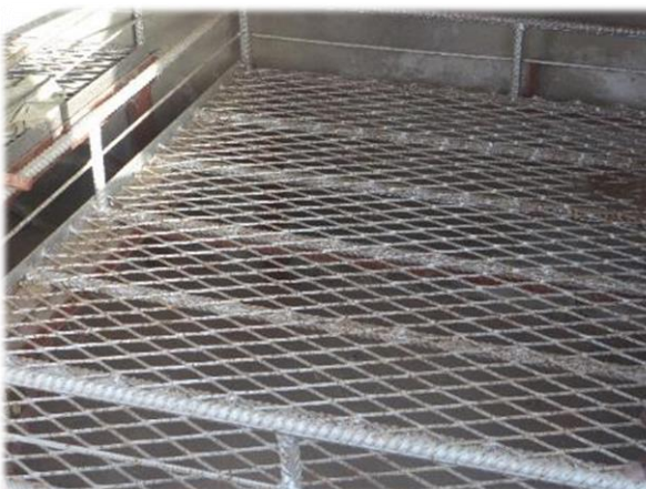
Photo 17 and 18. Degradations observed on the fish smoking kilns: i) the door no longer closes appropriately as a result of the rusting of the hinges; and ii) rust in the drawers.