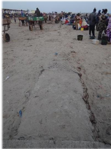
Photo 13. The dike and fishing dock almost entirely covered in sand. .