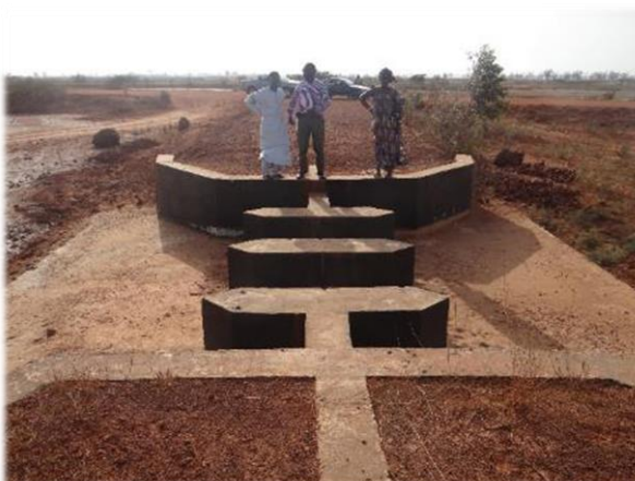
Photo 4. An element of the anti-salt dike, i.e. a rainwater discharge point, made of concrete which allows the drainage of surplus rainwater.