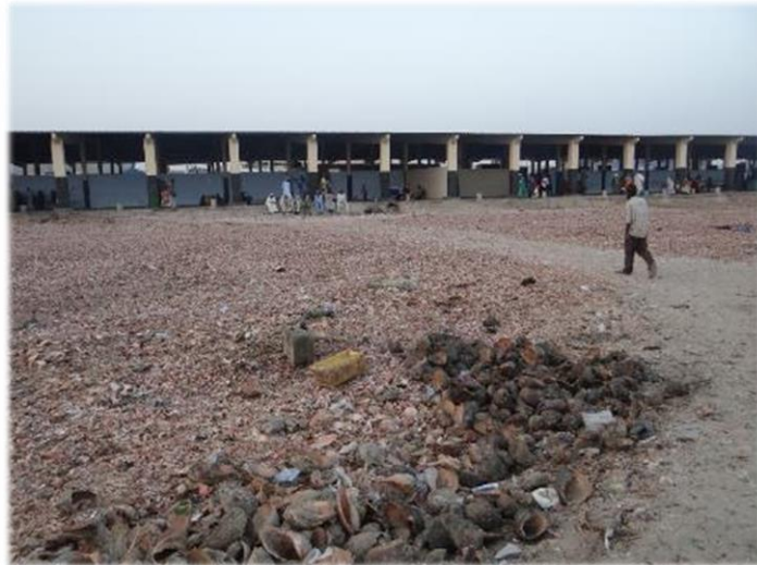
Photo 14. Artificial sand replenishment of the area between the fishing dock and the dike by means of shells and sand.