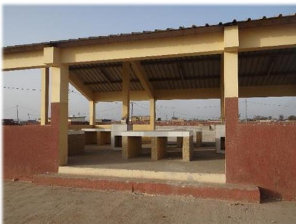
Photos 7 and 8. A shed structure rehabilitated by the AF-financed project which now has access to water.