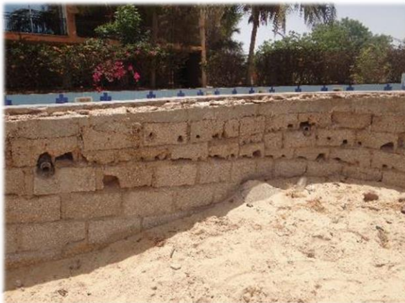
Photo 1. A pool that had been previously degraded by wave action recorded on the construction site for the seawall.

Considerable coastal erosion has occurred in Saly. For example, in 2002, a section of the beach in front of the Téranga Hotel was used by the national football team for training. However, the beach has almost completely disappeared. Indeed, over the last 12 years, 200-300 metres of beach has been lost. The negative effects associated with the loss of beaches are economically significant, as Saly is a major touristic attraction in Senegal. The loss of beaches could therefore lead to the closure of hotels, such as Savanna Hotel – which shut down in 2014 – and Hotel Espadon. The closure of Savanna Hotel resulted in the loss of a significant source of employment for local communities and a decrease in demand for local products, such as fruits, vegetables and fish.