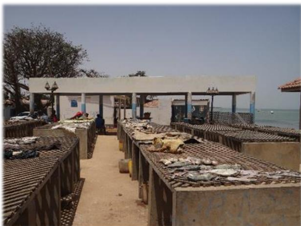
Photo 10. Drying grids and supporting structures rehabilitated by the AF-financed project.