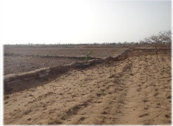
Photo 12. Bags demarcating the land parcels that were under rice cultivation in 2014.