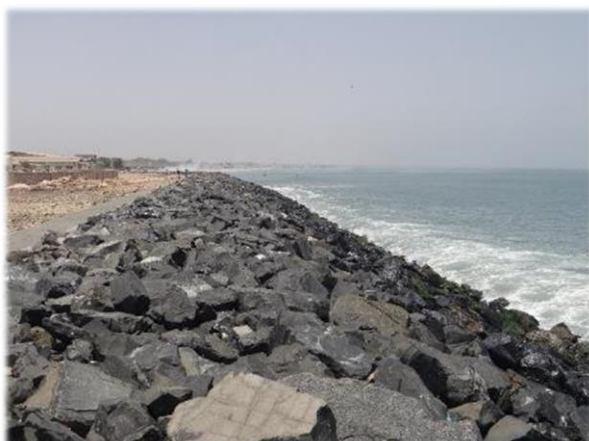
Photo 1. The basalt shell of the dike in Rufisque.