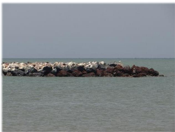
Photo 5. The extremity of one of the seawalls which contains laterite blocks on the right and basalt blocks on the left and on top.

Although a feasibility study was undertaken, there were different opinions on the construction material to be used – between laterite and basalt – for the construction of the seawalls. This has resulted in conflict between the executing agency, the construction manager and the construction company. Additionally, the cost of using basalt in the construction of the seawalls was under-estimated initially in the budget. Should laterite had been used – as opposed to basalt – the allocated budget would have been sufficient in ensuring the construction of nine seawalls as originally planned. However, there were concerns regarding the potential degradation of laterite in the long-term, and as a result, basalt was selected as the preferred construction material. The first order of basalt could not be used due to limestone inclusions and therefore the implementation of the seawalls in Saly was delayed. The basalt blocks were initially meant to be brought in by boats, however this was not feasible due to the rocky seabed. This further delayed the implementation process which resulted in a review of the construction strategy. Moreover, a reshuffle of the DEEC's staff including the officials managing the AF-financed project occurred in August 2013 thereby resulting in further delays in the implementation of activities in Saly.