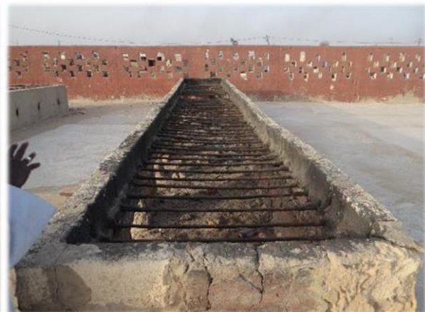
Photo 1. Traditional fish procession area in proximity to the anti-salt dike and smoke which is a health hazard is generated by the kilns. Photo 2. Example of a fish smoking kiln 6 metres in length.