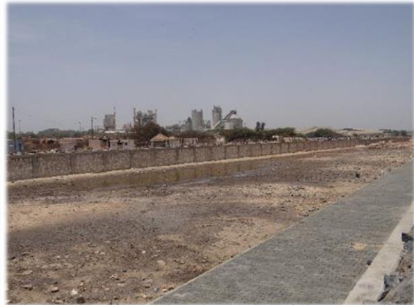
Photo 4. The esplanade and the cemetery are protected by a wall recently constructed and financed by the government.