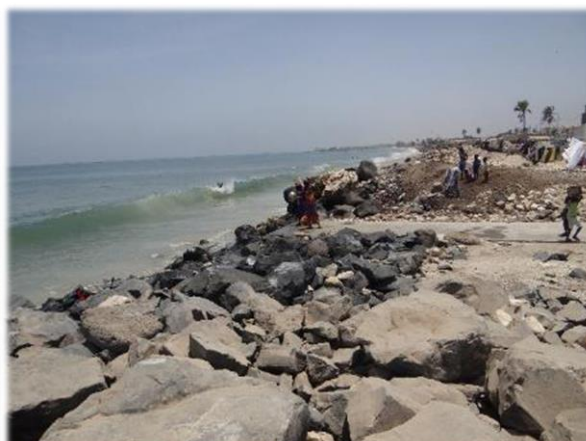
Photo 2. The evacuation canal which has been closed on the right end of the dike. Women and children are seen discharging grey water in the canal as demonstrated to them during the awareness-raising campaigns.