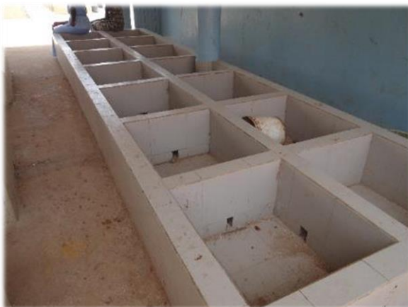
Photo 8. Under-utilised washing basins fitted with a water drainage system financed by the AF project.