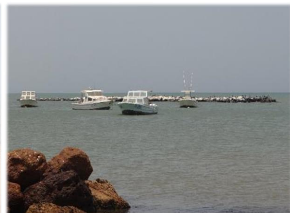
Photo 4. A seawall constructed in Saly.