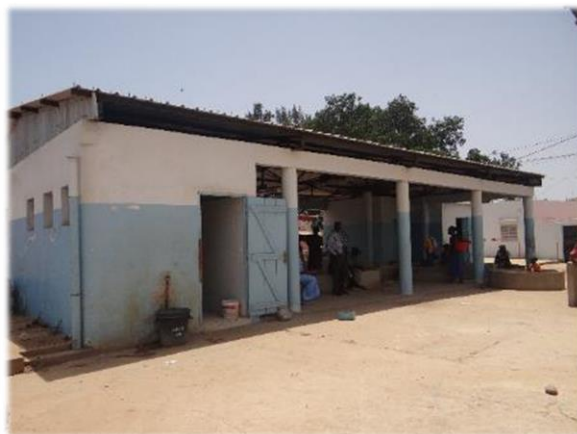
Photo 9. One of the two shelters financed by the AF project in the fishing dock and fish processing area in Saly.