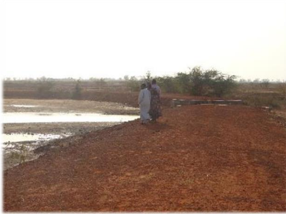
Photo 11. The water discharge basin on the anti-salt dike whereby the right and left banks meet, seawater is retained between the two openings and fresh water is retained upstream during precipitation.