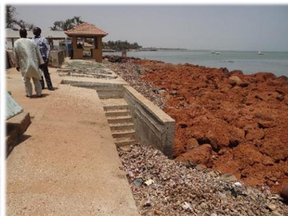
Photo 11. The basement of the fishing dock and a retaining wall rehabilitated and the replenishment of laterites financed by the AF.