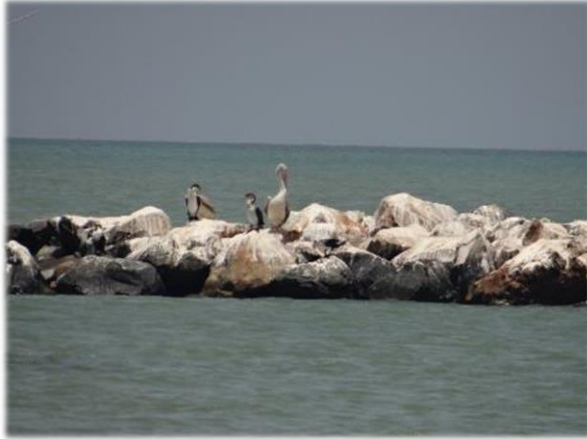
Photo 6. One of the seawalls financed by the AF used as breeding ground for seabirds.