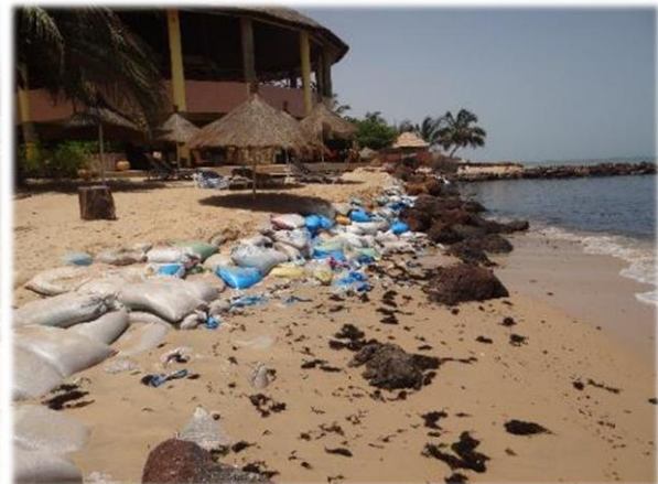
Photo 1. Several protection methods against coastal erosion implemented in front of a hotel in Saly.