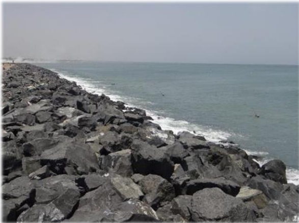
Photo 3. The fixed nets along the dike.