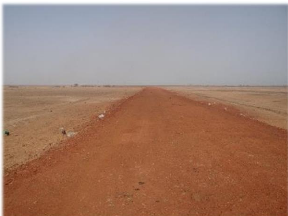
Photo 3. A portion of the left bank of the of the anti-salt dike in Joal.