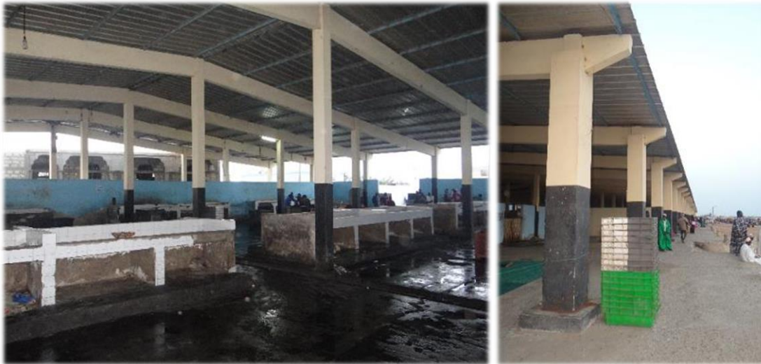
Photos 9 and 10. The pillars of the fishing dock were rehabilitated and the walls were painted.