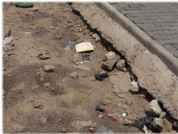
Photo 8. Scouring observed at the base of the promenade on the esplanade due to stagnant water.