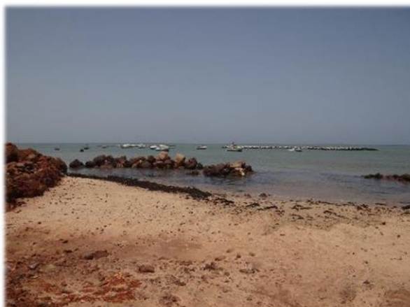
Photo 3. The seawalls financed by the AF project in Saly.

The two seawalls in Saly were constructed to protect against erosion and rehabilitation of the fishing dock and fish processing area of Saly-Coulang, as well as: i) the rehabilitation of the fishing dock's foundations, the construction of the fishing dock's retaining wall and the artificial beach replenishment with laterites in the vicinity of the fishing dock; ii) the construction of the washing basins; iii) the construction of shelters to improve working conditions; iv) the construction of ; v) access to water at the fishing dock; and vi) the installation of the solar lighting.