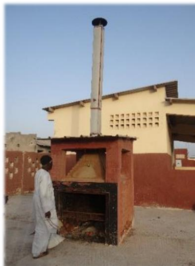
Photo 6. Prototype of a fish smoking kiln used for tests.