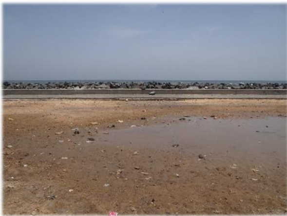
Photo 7. Stagnant water on the esplanade.