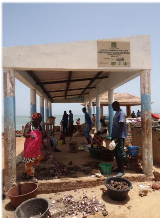
Photo 13. Second shelter financed by the AF with a plaque indicating the source of financing. Degradation of the shelter is apparent.