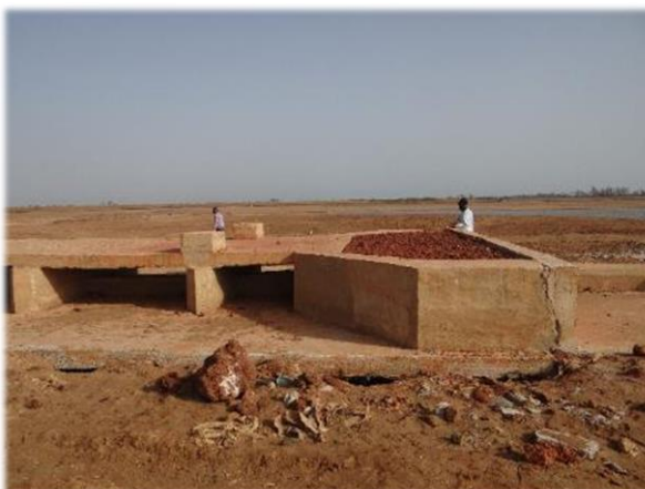
Photo 16. Scouring at the base of the rainwater discharge point and a crack in the wall.