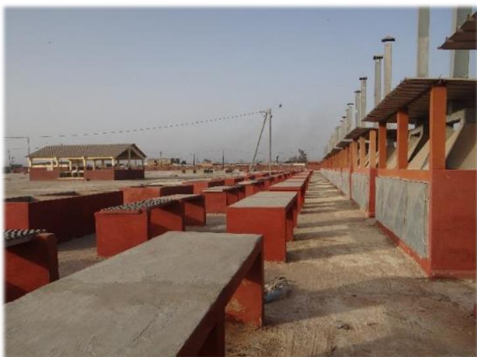
Photo 5. Fish smoking kilns, tables and drying grids financed by the AF in Khlecom.