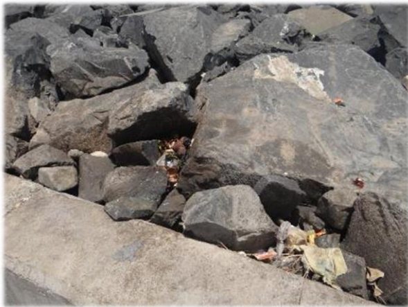
Photo 5. Accumulation of solid waste in between the openings of the basalt rocks in the dike's shell.