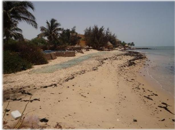
Photo 7. Beach replenishment prior to the construction of the first seawall financed by the AF.