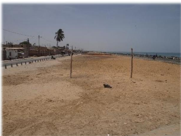
Photo 9. Poles have been erected on the esplanade to delineate a football field.

List of participants of the focus group meeting held on 4 June 2015 in Rufisque.