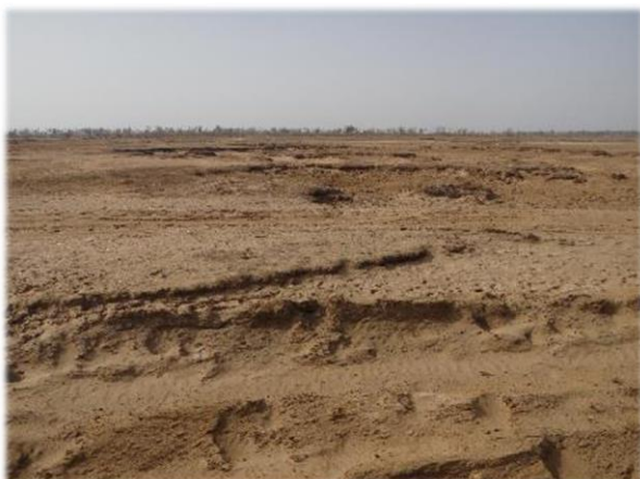
Photo 15. Illegal sand extraction upstream of the anti-salt dike financed by the AF.