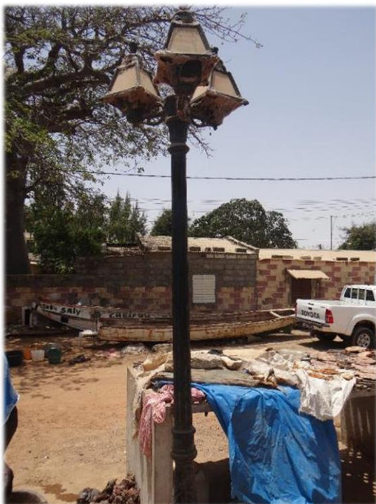
Photo 12. Solar lighting system financed by the AF which is no longer functional.