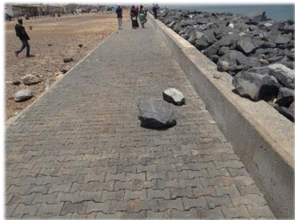
Photo 6. Basalt rocks projected onto the promenade as a result of a recent storm.