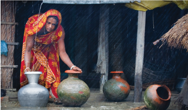
Bangladesh, by Mahbubur Rahman

“NIE accreditation has had important catalytic effects by creating interest in other national institutions to demonstrate that they can also meet robust fiduciary, transparency and management standards.” – Overseas Development Institute