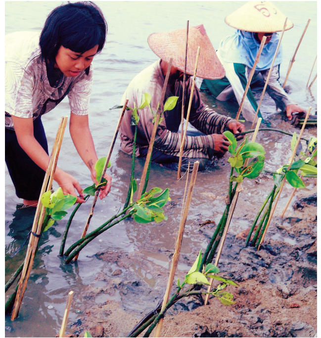
Indonesia, by Falik Rusdayanto

aspects of climate adaptation and resilience projects, from design through implementation and monitoring.