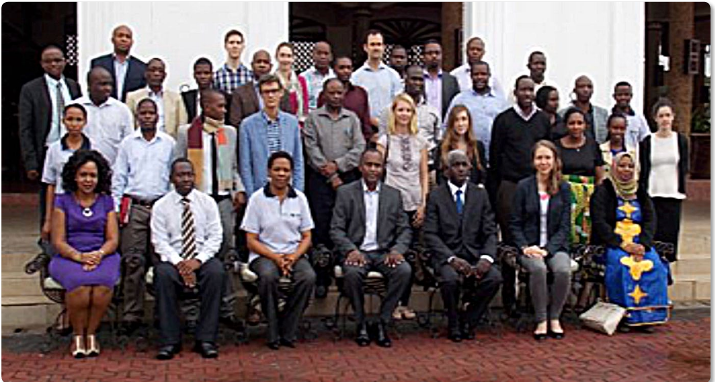
Group photo of participants with the Guest of Honourable Minister of State-Environment (Binilith Mahenge)