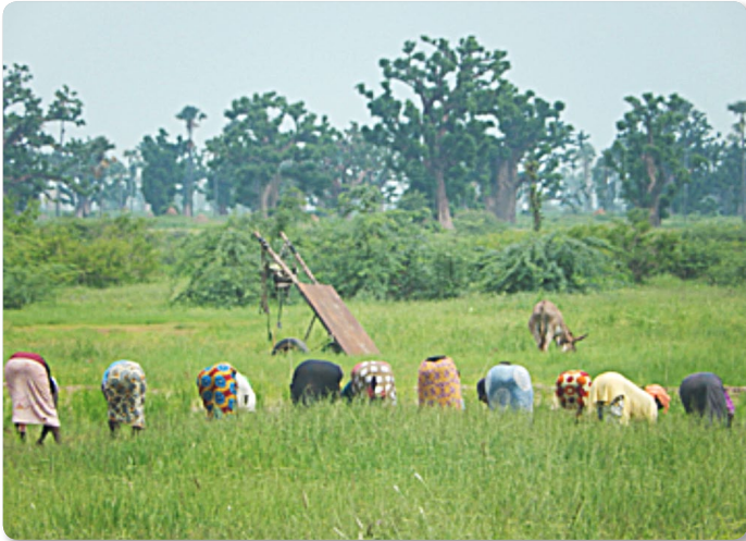
Women Group working in the field gained as result of desalinisation through the Anti-salt dike

The project pursued three objectives: a) reducing coastal exposure by protecting infrastructure including fishing docs and processings; b) measuring that includes anti-salt dikes to protect agricultural lands and sea defenses and c) developing coastal management policies and regulation. It was implemented in three cities (Rufisque, Saly and Joal). These cities play a key role in Senegal's economy particularly in the tourism and fishery branches.