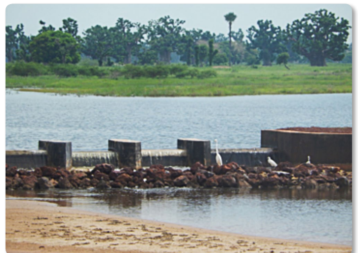
Anti-salt dikes to protect agricultural lands and sea defenses in Joal

The accreditation has allowed the CSE to submit the first direct access programme "Adaptation to Coastal erosion in Vulnerable Areas" for a total amount of USD 8,619,000. The project is now concluded. This article provides an update on the main achievement of the project, by exploring potentials for replication and sustainability.