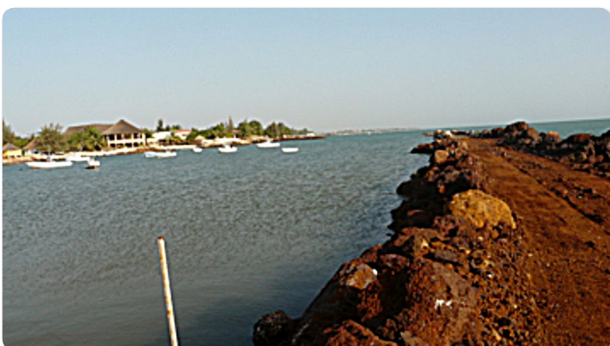
A 730 meter seawall built along the coastline In Rufisque

The Project has built an anti-salt dyke over three kilometers, which has enabled to gain new agriculture field that was unused over decades. It also helped to regenerate natural vegetation and recovery of biodiversity. In Joal, the project has helped to introduce modern ovens and improve the fish processing, which in turn has reduced the stress on fuel wood. In Saly, the drying areas and methods of fishery products have been rehabilitated with an extent of 878 m 2 . In Rufisque, a 730 meter seawall was built along the coastline. This seawall is meant to protect habitation, the cemetery, as well as the culture heritage of the town that are close to the beach. The