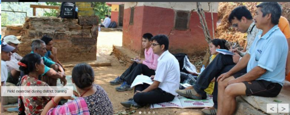
Field exercise during district training

HOME COMPONENTS PPCR 3: MCCRMD KNOWLEDGE CENTER GALLERY KEY PARTNERS RADIO CONTACT US