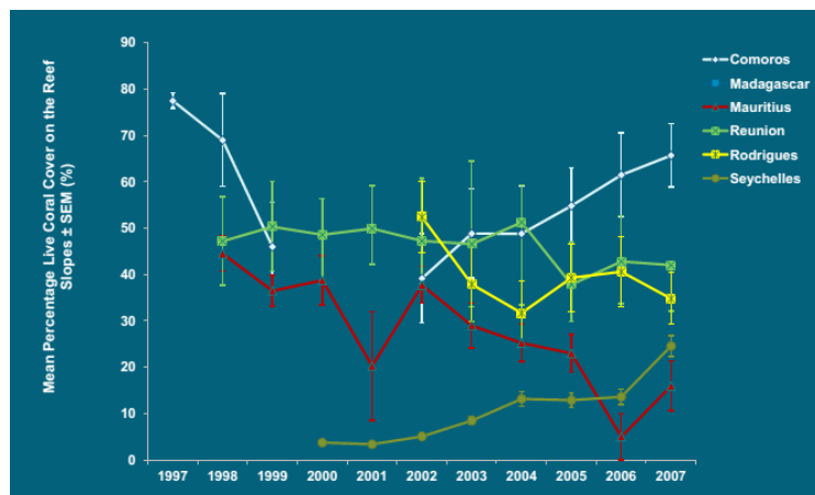
Fig. 2 Trends in live coral cover in the COI countries, 1997-2007. Red line= Mauritius; yellow line = Rodrigues; brown line – Seychelles

Most recently, in 2015-2016, the largest bleaching event that reefs have seen worldwide since recording started has taken place 22 . Coral monitoring of the extent of the bleaching, the mortality that has ensued and the potential for recovery is currently underway, but preliminary information from Seychelles and Mauritius indicate that reefs in both countries were badly affected, and that the recovery that had started to be seen has been reversed in many locations. At two monitored sites in Mauritius (Ile aux Benitiers and Flic en Flac) live coral cover was about 70% in 2012 but dropped to 32-38% in 2015 23 . In Seychelles, on the inner granitic island reefs, which by 2012 were in many places dominated by macroalgae, coral recovery has been shown to be constrained by unsuccessful settlement or poor post-settlement survivorship; and equally on rubble dominated reefs high densities of juvenile corals failed to translate into high cover of adult corals because of the lack of a conducive environment 24 . By 2014, the inner Seychelles hard coral communities were assessed as having lower generic diversity and lower abundance of adult hard corals than other coral reef regions of the Indian Ocean for which comparable data were available 25 .