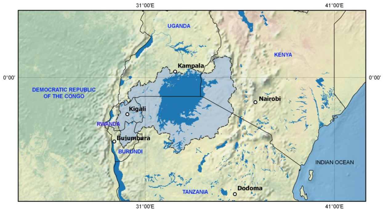
Figure 1. Map of the Lake Victoria Basin (light blue with dashed outline), which contains Lake Victoria (dark blue) and overlaps with Burundi, Kenya, Rwanda, Tanzania and Uganda. The capital city of each LVB country is indicated with a white circle.

The LVB is contained within the southern section of the Nile River Basin (NRB), between the Eastern and Western Rift Valleys. The LVB catchment area is ~195,000 km 2 and contains Lake Victoria, the world’s second largest freshwater lake, which has a surface area of ~69,000 km 2 , a mean depth of ~40 m and contains ~2,750 km 3 of water 3 . Lake Victoria extends into three countries, namely Kenya, Tanzania and Uganda, while the LVB extends further to include Burundi and Rwanda (Figure 1).