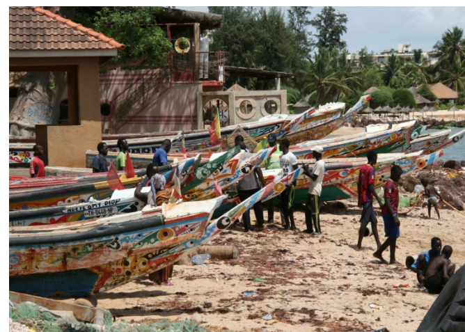
Fishermen in Saly in Senegal, one of the AF project sites