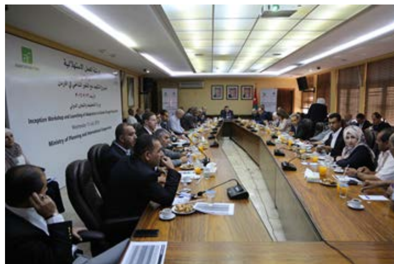
Stakeholder workshop in Jordan