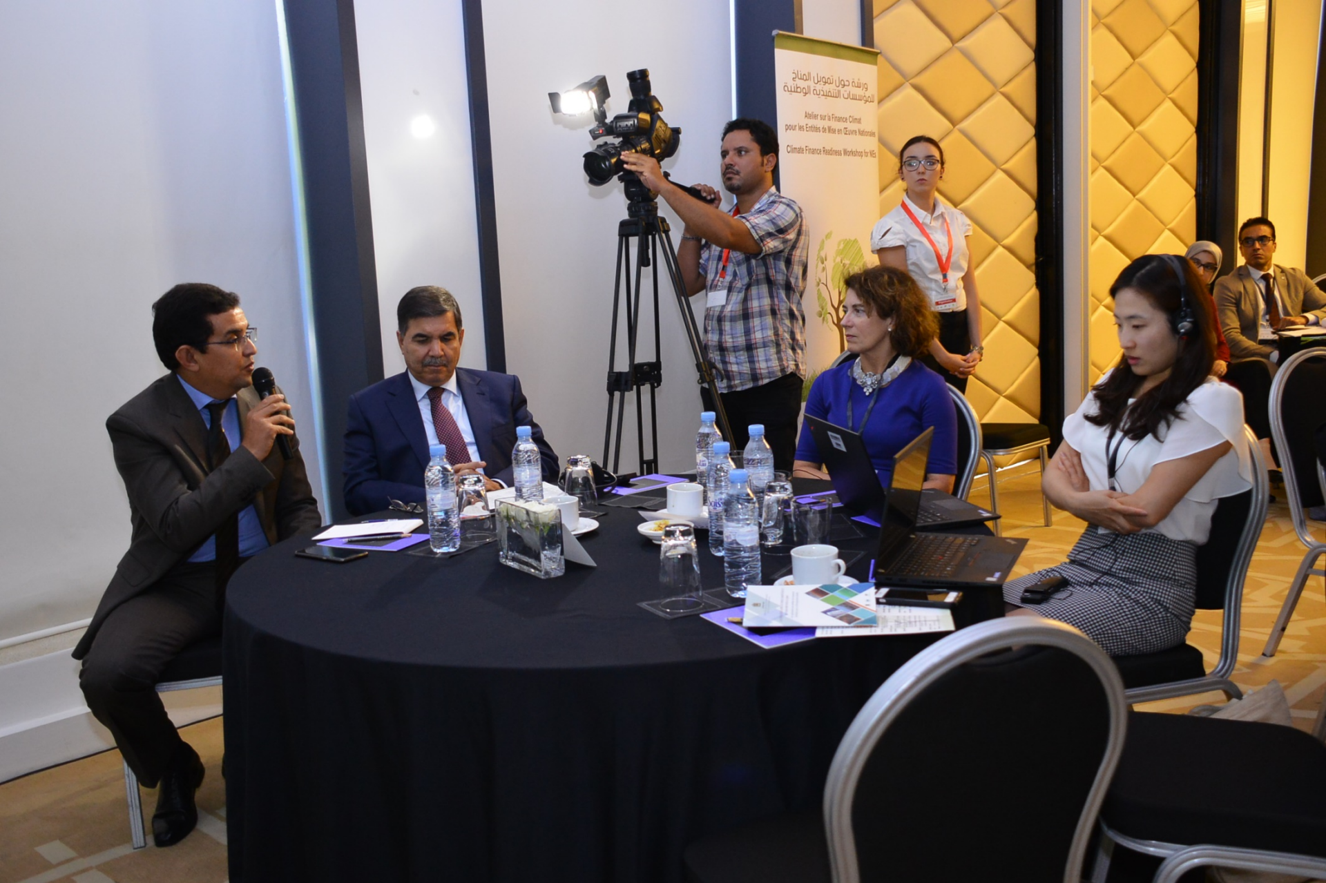
AFN members making a civil society intervention during a regional workshop on readiness organised in 2016 by the Adaptation Fund Secretariat in Morocco