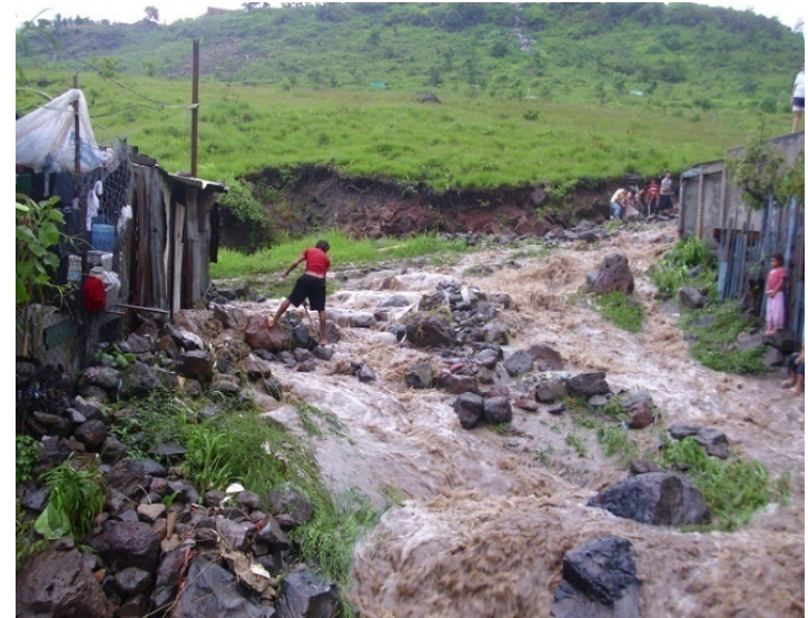
The AF project in Honduras