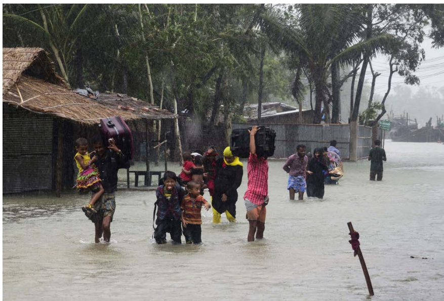
People affected by floods in a rural community