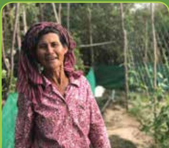
REFORESTATION PROJECT IN CAMBODIA