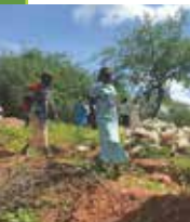
ENHANCING FOOD SECURITY IN KENYA