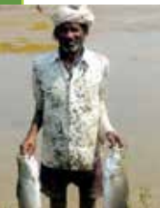
FISH FARMS IN INDIA

NIE: National Bank for Agriculture and Rural Development (NABARD)