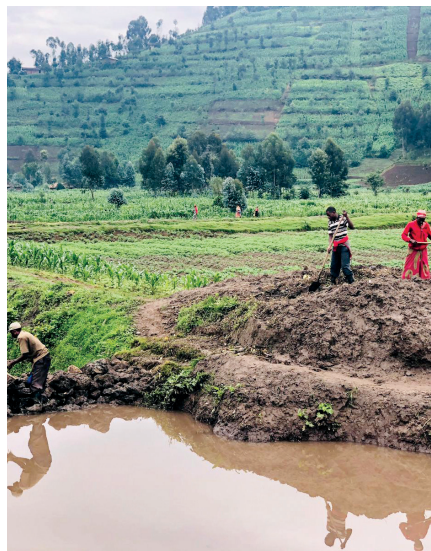
Left: Mugogo lowland. Right: Maintaining drainage channel (foreground), with bench terracing in background hills.