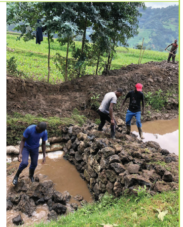
Community members install earthen dams to reduce sediment and regulate water flow in drainage channels of Mugogo lowland.

● Resettle 200 households from high risk zones in Nyabihu District to Kabyaza Green Village where more than half of households headed by women