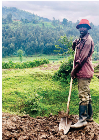
Cleaning drainage channels in Mugogo lowland.

The project also focused on resettling 200 extremely poor households from high-risk areas in Nyabihu District to a newly designed “green village”, where climate-resilient homes were constructed in a safe zone and provided with rainwater tanks and biogas. Women as heads of household are empowered, and village residents are involved in the project’s decision-making processes to help sustain the assets that were built. This includes a project sustainability component referred to locally as “muganda”, where the community comes together once a month to work to maintain these physical and natural structures.