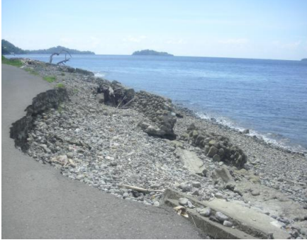
Figure 2. The impact of tidal waves and abrasion in the form of damage to road infrastructure and breakwater walls due to tidal waves