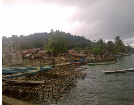
Figure 3. Fishermen built stilt structure for docking their boats due to the increase of sea water level

Another ecological impact recorded is the loss of coastal plants, including large trees that had been washed out by the sea. In addition, Fishermen who are affected by the increase of sea water level also realize that currently sea water has reached the backyards of some of their houses and is inundating the beach that is used to be used as the pace for mooring (drying) their boats.