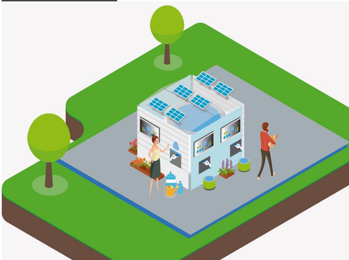
Designed by Division for Regional Planning and Development of Valparaíso (2019).

The Chilean government understands that this initiative is not a solution for the current water crisis of the region. Therefore, it sees as fundamental to work on technologies