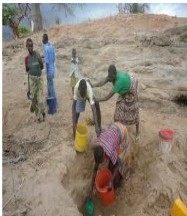
Plate 1: The photo taken from Runyinya village in 2015 illustrating the intensity of water scarcity.

be implemented to enhance water availability for domestic use and crop production in the area, the trend will continue endlessly, with disastrous effect to the vulnerable community groups like women and children.