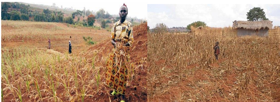
Plate 2: Photo showing crop failures and bad yield in the larger area of Runyinya village Kyerwa district.

According to reports available in the district, hunger pangs were equally felt more in the past three decades in most villages, in which more than 50% of people were reported to be facing starvation due to a poor harvest. The persistent food scarcity in most villages has led to a sharp rise in food prices in the district. For instance, traditional food inflation jumped from 6.9 per cent in 2016 to 17.4 per cent in July 2018, the highest since 2010 (Plate 2). From 2016 up to now, prices of items such as beans have for instance peaked at Tsh 2700 for a kilogram, twice the usual price of between Tsh 1000 and Tsh1400. These prices are not affordable to common and marginalized village communities such as those in Runyinya. This kind of weather related vagaries has sometimes stemmed forced migration and school dropouts including deep income and food