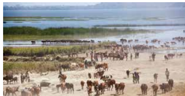
Left: Weather equipment that supports weather data collection and dissemination at Voi Meteorological Station in Taita Taveta, Kenya. Above: Pastoralists bring their herds of livestock to water at Lake Hawassa in Shelfo village, Ethiopia.