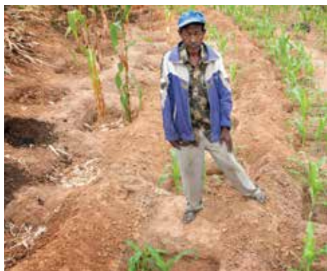
Left: Woman digging in garden of sweet potatoes in Siaya District, Kenya. (Photo by FAO) Right: Man stands in his first round of maize crop which failed due to drought in Machakos District, Kenya. (Photo by FAO)