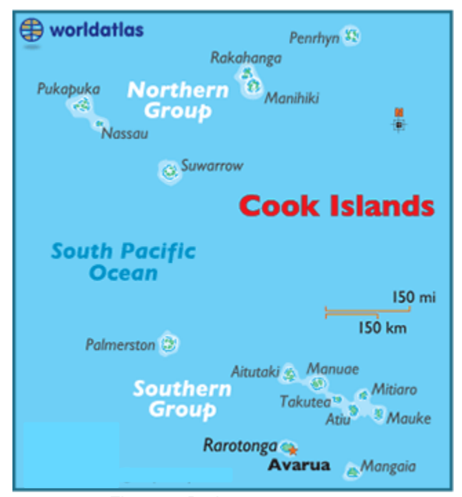
Figure 2: Projects target areas

change impacts. It will do so through the following components: i) Strengthening national and local capacity for monitoring and decision making to respond and to reduce risks associated with climate change; ii) Establishing climate resilient water management instruments using integrated and community based approach; and iii) Raising awareness and establish a knowledge exchange platform to increase adaptive capacity to revitalize agriculture production systems.