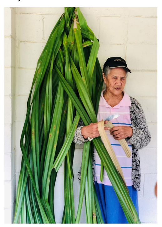
Picture 2: Woman preparing the material for weaving handicrafts in Mangaia