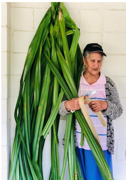
Picture 2: Woman preparing the material for weaving handicrafts in Mangaia

26. The other visited island Mangaia belongs to the northern group of islands, and its population is approximately 300 hundred people. This island presents a volcanic soil which is apt to cultivate. Here the UNDP project provided fishing boats which helped creating a resilient economic stream for the people, provided wheelchairs to disabled people and installed touristic street signs indicating points of interest on the entire island. The Pearl project is upscaling the results of the UNDP project by conducting a household survey to update the disaster risk management plans, and the agricultural component is upscaled through the involvement of young farmers, which are mostly women. As part of livelihoods diversification activities women are working with coconut, weaving, sewing and making other handicrafts, and they receive about 10 tourists per month to whom they can sell their handicrafts.