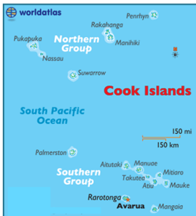
Figure 2: Projects target areas

change impacts. It will do so through the following components: i) Strengthening national and local capacity for monitoring and decision making to respond and to reduce risks associated with climate change; ii) Establishing climate resilient water management instruments using integrated and community based approach; and iii) Raising awareness and establish a knowledge exchange platform to increase adaptive capacity to revitalize agriculture production systems.