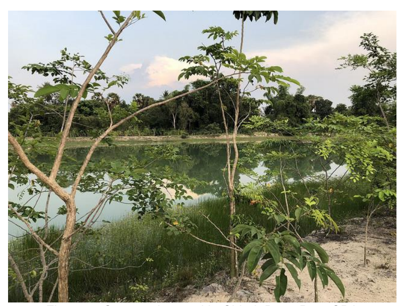
Figure 5: Community pond in Chiork Beng Prey CPA

21. To address the water scarcity challenge, within the four project targeted CPA sites that were visited by the mission, the project has constructed 103 ring wells, two ponds, 53 pumping wells, three solar panels and two water pipes from springs. The project conducted a study on non-stop water flowing bodies and built a pilot cascade embankment in Chop Tasok. In Chop Tasok CPA that is remotely located on the top of Kulen mountain where there is extreme water run off, leaving the communities vulnerable to water scarcity, the project has constructed a spring water collecting structure. The structure is 2 km from the village and each household has access to water from this structure. In addition, nine water containers have been built for villages. Selected households have also been provided with plastic containers, watering containers and mesh nets to cover containers. The project also quickly learnt that CPAs outside of project targeted areas are in urgent need of similar water supply infrastructure and is developing a strategy to scale up water supply interventions.