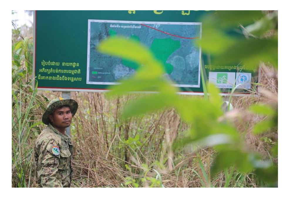
Figure 3: Forest Patrolling Unit Officer in Phom Kulen