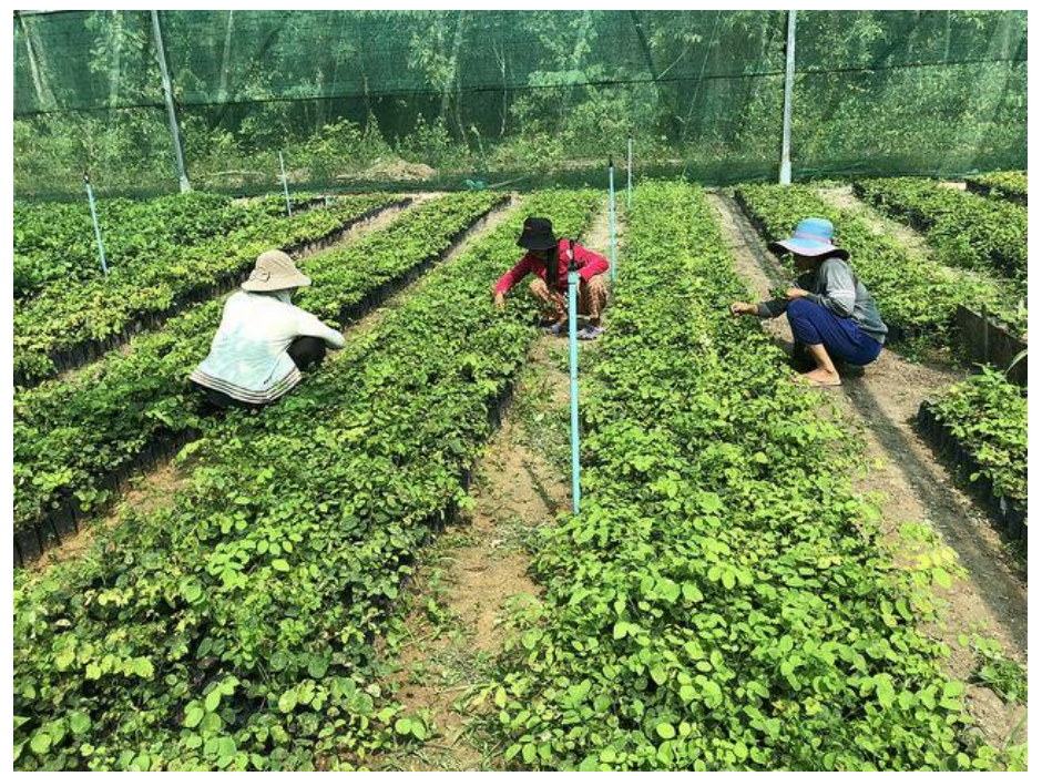
Figure 2: Nursery in Chiork Beng Prey CPA