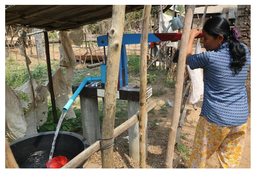
Figure 4: Water pump constructed in Skor Krouch CPA

21. To address the water scarcity challenge, within the four project targeted CPA sites that were visited by the mission, the project has constructed 103 ring wells, two ponds, 53 pumping wells, three solar panels and two water pipes from springs. The project conducted a study on non-stop water flowing bodies and built a pilot cascade embankment in Chop Tasok. In Chop Tasok CPA that is remotely located on the top of Kulen mountain where there is extreme water run off, leaving the communities vulnerable to water scarcity, the project has constructed a spring water collecting structure. The structure is 2 km from the village and each household has access to water from this structure. In addition, nine water containers have been built for villages. Selected households have also been provided with plastic containers, watering containers and mesh nets to cover containers. The project also quickly learnt that CPAs outside of project targeted areas are in urgent need of similar water supply infrastructure and is developing a strategy to scale up water supply interventions.