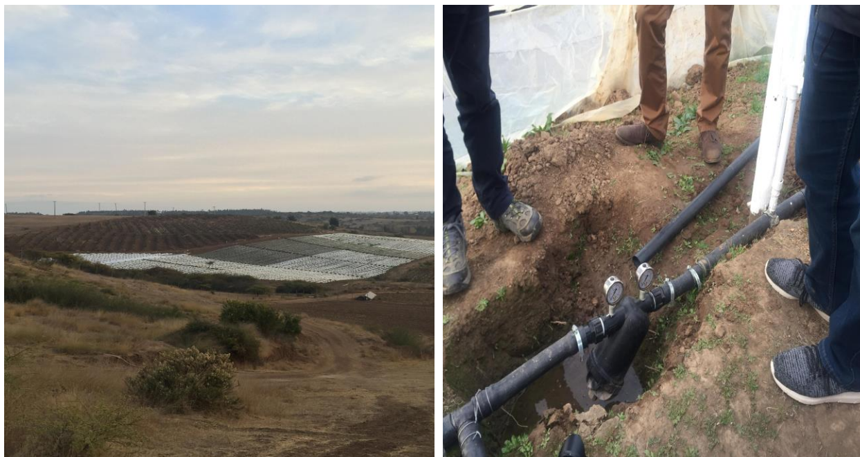
Picture 4: (Left) Strawberry field with solar powered irrigation system (solar panels not pictured). (Right) Fertigation system in which fertilizer is dissolved and distributed along with water in drip or spray irrigation system.