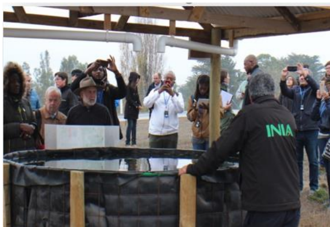
Picture 2: INIA Technical Programme Coordinator demonstrates an open rainwater catchment system

27. AGCID expressed that it was in a race against time to expand the project as the country enters its tenth year of drought. O'Higgins receives barely 50 percent of what would be considered its normal rainfall, and this has occurred for the last ten years. This has caused a decrease in ground vegetation and a need to alter ploughing methods. Current ploughing methods were not going deep enough and were causing the ground to become hard packed, preventing easier planting of crops.