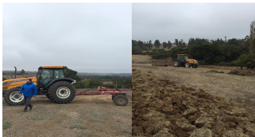
Picture 1: (Left) Subsoiler plough; (Right): Subsoiler plough tool works between 35 to 45 centimeters under the surface, allowing the rupture of compacted soil layers or hardpan.

22. A number of other machinery and tool are being piloted at the Hidango (Experimental Station INIA Litueche). These include: plow subsoiler scaler, moldboard plow, vibro cultivator, incorporator harrow stubble harrow offset disc seeder zero tillage, regenerative grassland, machine applicator guanos, spray bar, seeder, chipper stubble, backhoe, tractor, small truck, colossus, oil tank and manual fuel pump, manual bailing hay, honey extractor etc. Farmers have access to the equipment for their individual properties. INIA also acquires seeds, fruit, sheep, beehives and beekeeping equipment for management training.