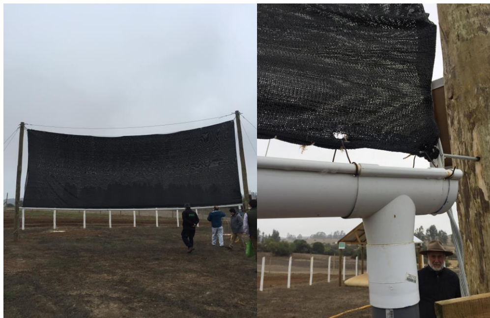
Picture 3: (Left) INIA's "fog catcher" device. (Right) Mist and fog are collected on the large tarp and channeled into water catchment devices.

principal technical advisor institution, the INIA, which oversees the water catchment demonstration plots.