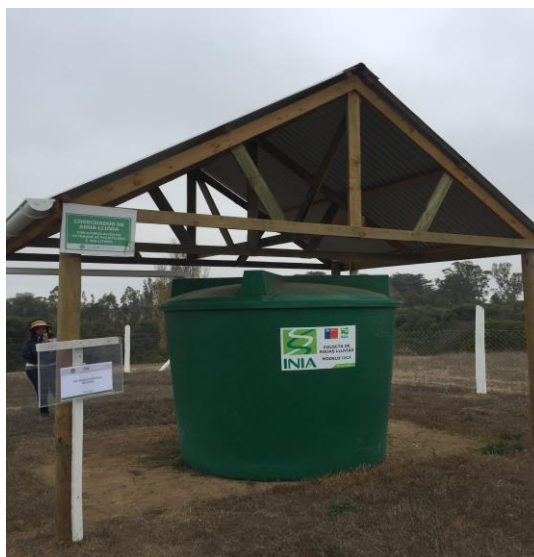
Picture 4: Rainwater collection tank with a capacity of 5,400 liters is also provided by the project to beneficiaries.