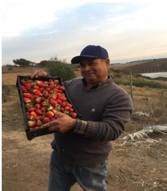
Picture 5: Strawberry farmer who benefitted from increased production due to technology transfer and capacity building activities of the project.

34. The mission team learned that the project is targeting female-headed household for project initiatives. The project uses a system of safeguards including a new “Plan of Action for Gender Mainstreaming”. The new plan is necessary as AGCID noted most activities were carried out by women, yet men had access to the majority of resources.