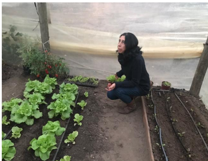
Picture 6: Female headed household beneficiary that benefitted from a greenhouse and a rainwater harvesting tank (not pictured)

37. Another factor AGCID had to consider was the aging farming population. Seventy percent of the famers in the O'Higgins region are 50 years or older. Relatedly, 65 percent of the farmers did not finish high school. To deal with this issue, the Chilean Government is working to attract more youth to rural areas. AGCID is actively promoting farming as a viable career and has proposed a system of subsidies for youth in the region to encourage them to stay in rural areas or return from urbanized areas.