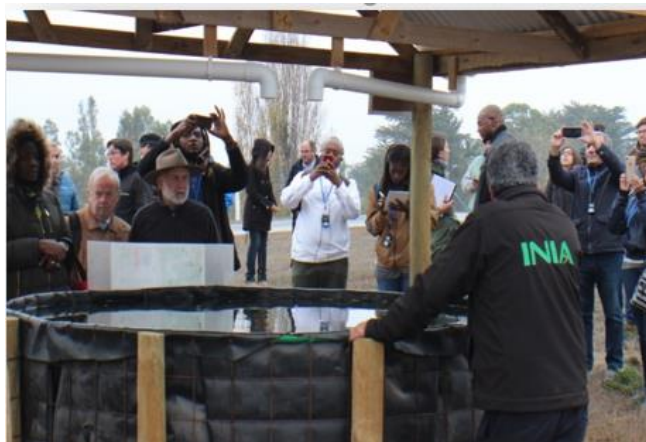
Picture 2: INIA Technical Programme Coordinator demonstrates an open rainwater catchment system

27. AGCID expressed that it was in a race against time to expand the project as the country enters its tenth year of drought. O'Higgins receives barely 50 percent of what would be considered its normal rainfall, and this has occurred for the last ten years. This has caused a decrease in ground vegetation and a need to alter ploughing methods. Current ploughing methods were not going deep enough and were causing the ground to become hard packed, preventing easier planting of crops.