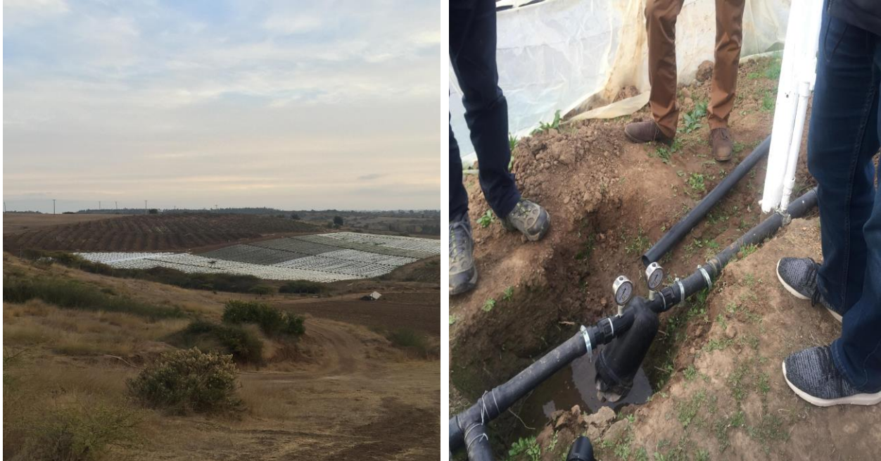
Picture 4: (Left) Strawberry field with solar powered irrigation system (solar panels not pictured). (Right) Fertigation system in which fertilizer is dissolved and distributed along with water in drip or spray irrigation system.