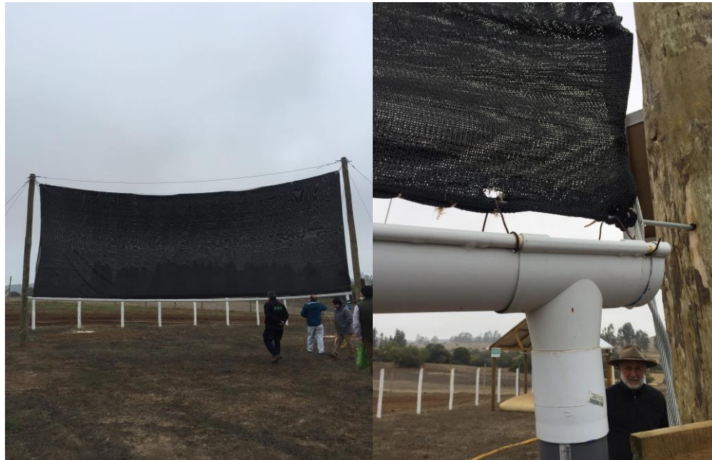
Picture 3: (Left) INIA's "fog catcher" device. (Right) Mist and fog are collected on the large tarp and channeled into water catchment devices.

principal technical advisor institution, the INIA, which oversees the water catchment demonstration plots.