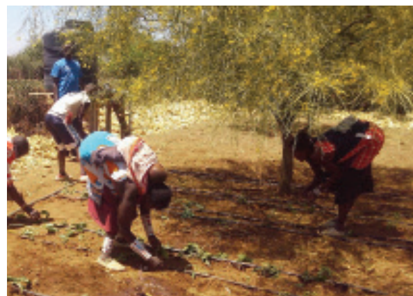
Women planting vegetables in the smart kitchen gardens using low-cost drip irrigation in Kajiado, Kenya. Drip irrigation has demonstrated that it can replace time-consuming tasks of hand irrigation and fertilization, while increasing yield, reducing pest problems, and saving water. The project is implemented by National Environment Management Authority in Keyna. (Photo by Nasaru Women's Group)

— South African National Biodiversity Institute