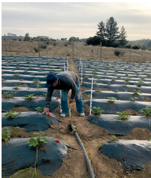
AF-funded project in Chile helps smallholder farmers adapt to dry conditions and manage water. Project implemented by Agencia de Cooperación Internacional de Chile (AGCID-Chile).