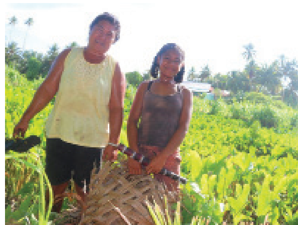
Mother and daughter have just harvested their taro for their daily meal. The project in Cook Islands implemented by Ministry of Finance and Economic Management installed culverts around the taro plantations to drain flooding waters that damaged the root crops.

“The projects are localized. It's about making a difference on the ground. They are replicable, scalable and it's also about catalyzing much bigger things. It enables local actors and can be transformational.”