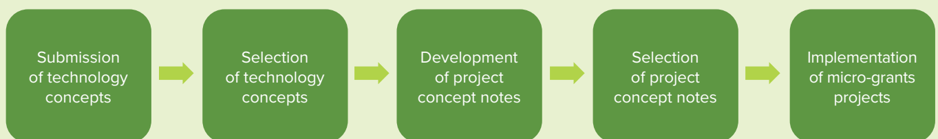
Figure 1: Operation and management process of the programme