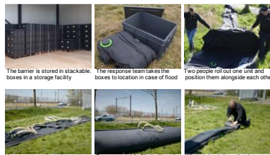
Figure 1: How to operate the technology

21. The SLAMDAM-technology is easy to operate, maintain and repair. It is therefore not complicated to enhance the skillset of people involved in flood risk management through trainings and capacity building workshops. The technology is simple yet highly effective in flood prevention. Once the local flood response team is trained, they are able to deploy the flood barrier independently.