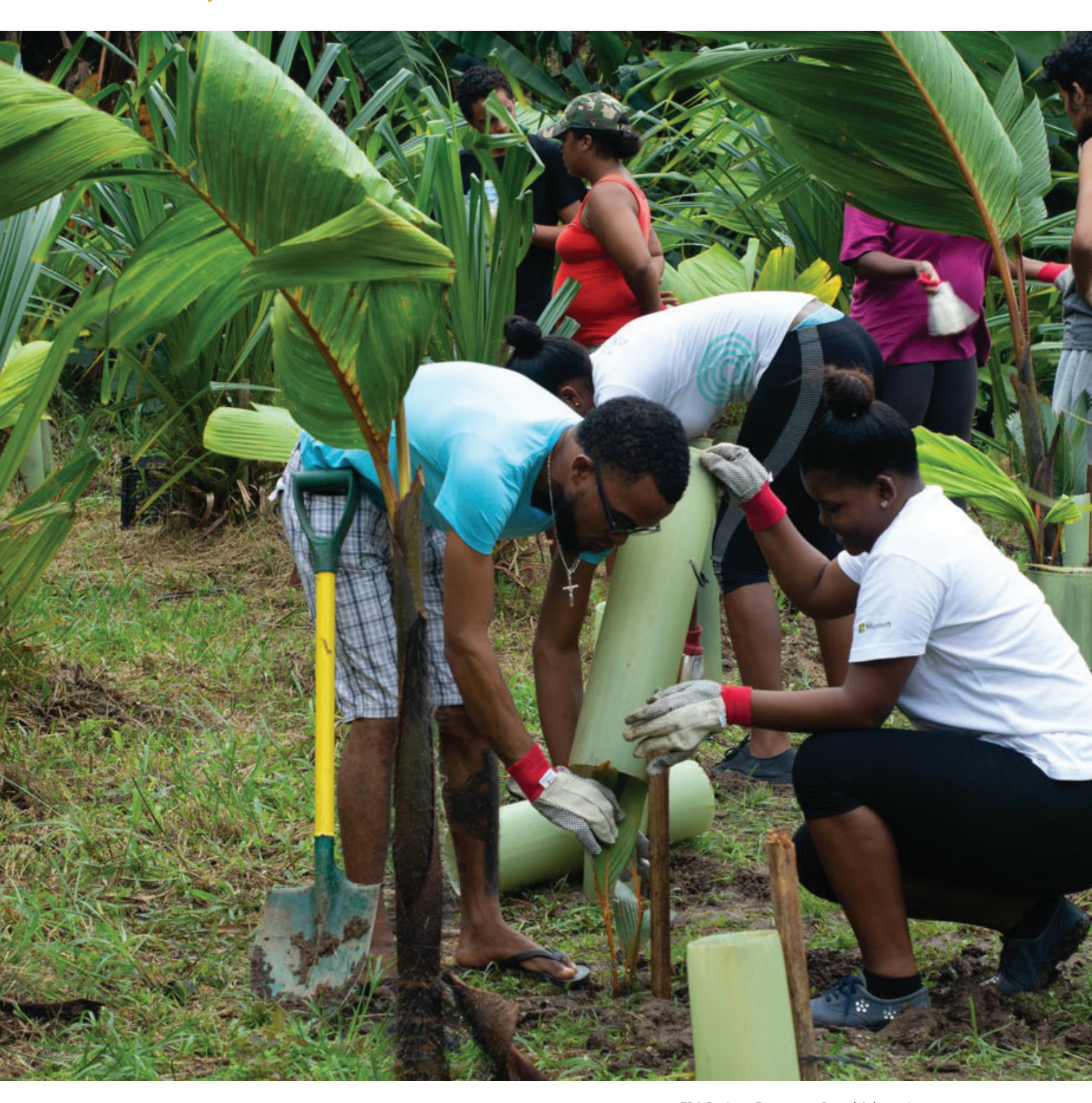
EBA Project- Ecosystem Based Adaptation to Climate Change in Seychelles UNDP