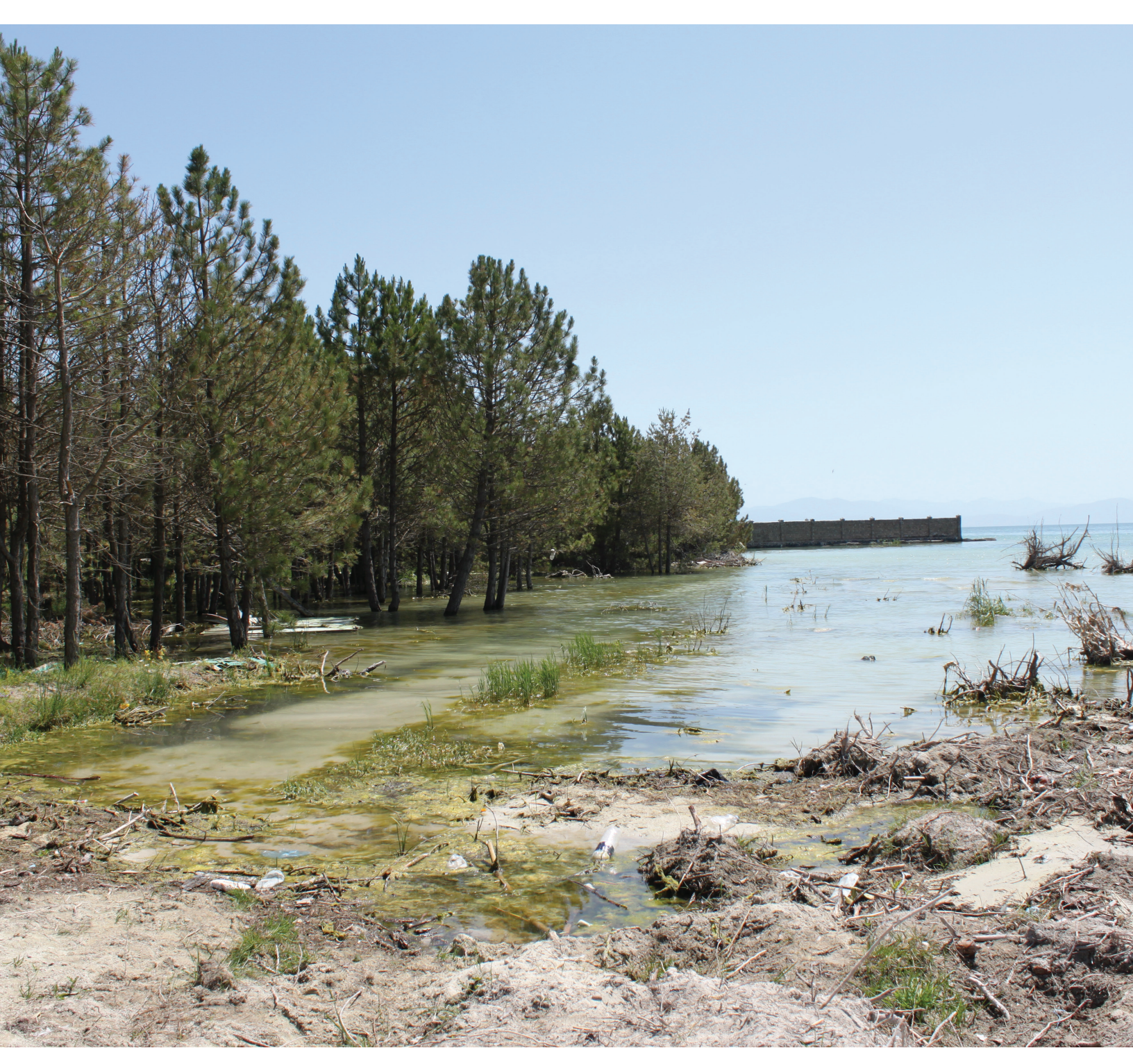
The Fund's first Direct Access project in Eastern Europe was launched recently in Armenia by by the country's Environmental Project Implementation Unit (EPIU).

5.2.4 Armenia – Innovation Project – Engaging Future Leaders: Digital Education Module on Adaptation Challenges and Best Practices for Youth – Environmental Project Implementation Unit (EPIU) (US$231,250)