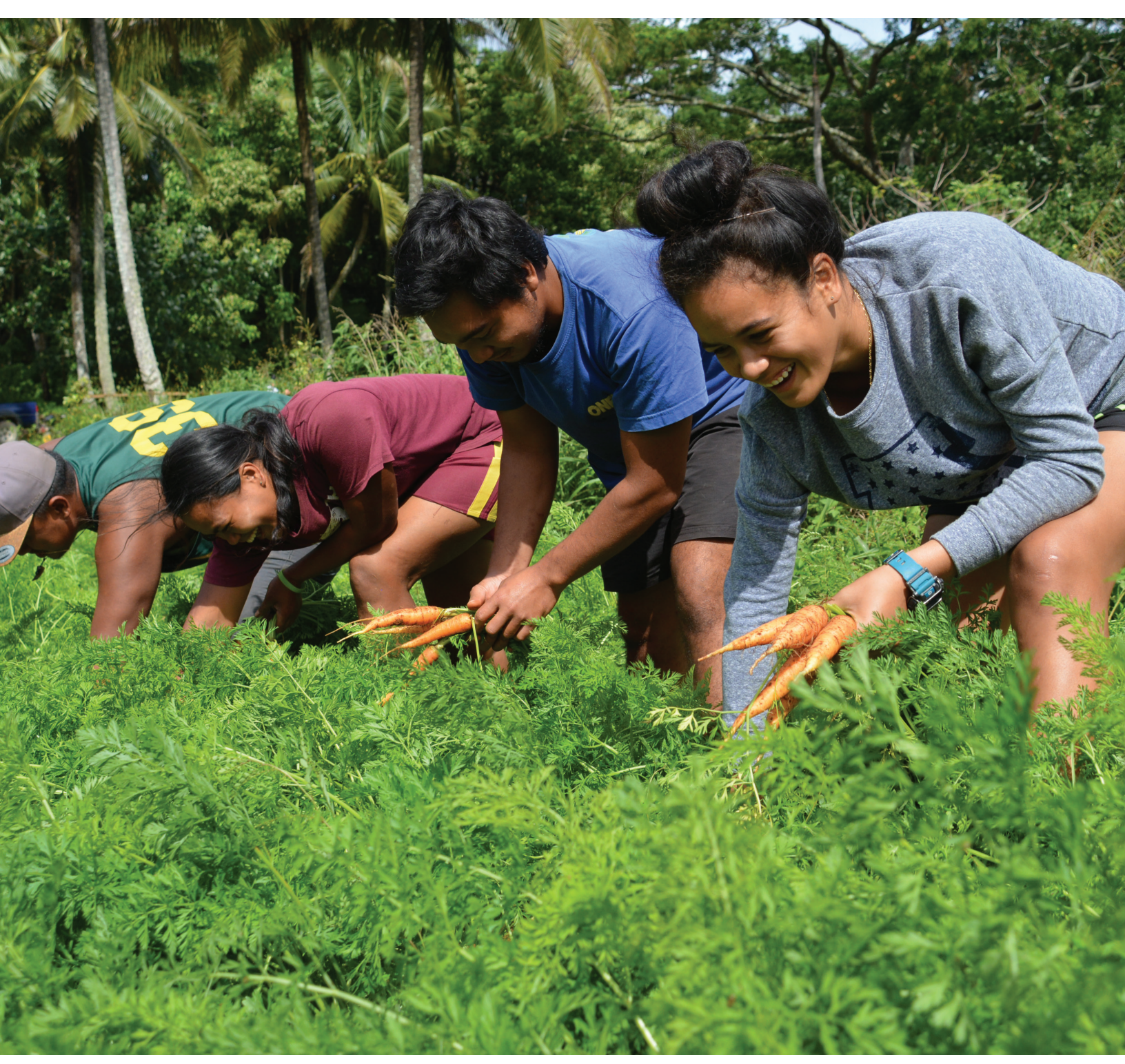
Young farmers in Mangaia, Cook Islands.