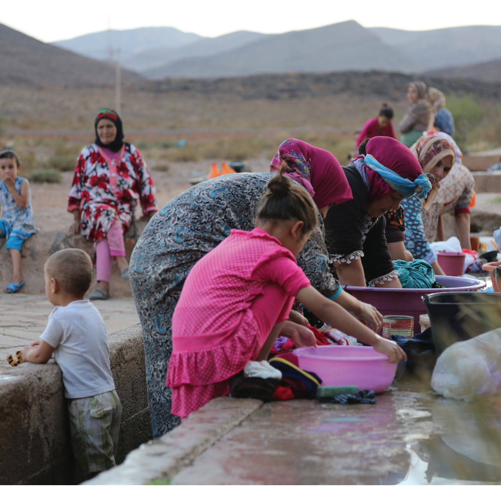
The Adaptation Fund project in Morocco is helping vulnerable populations become resilient to drought by reviving ancient underground water canals.