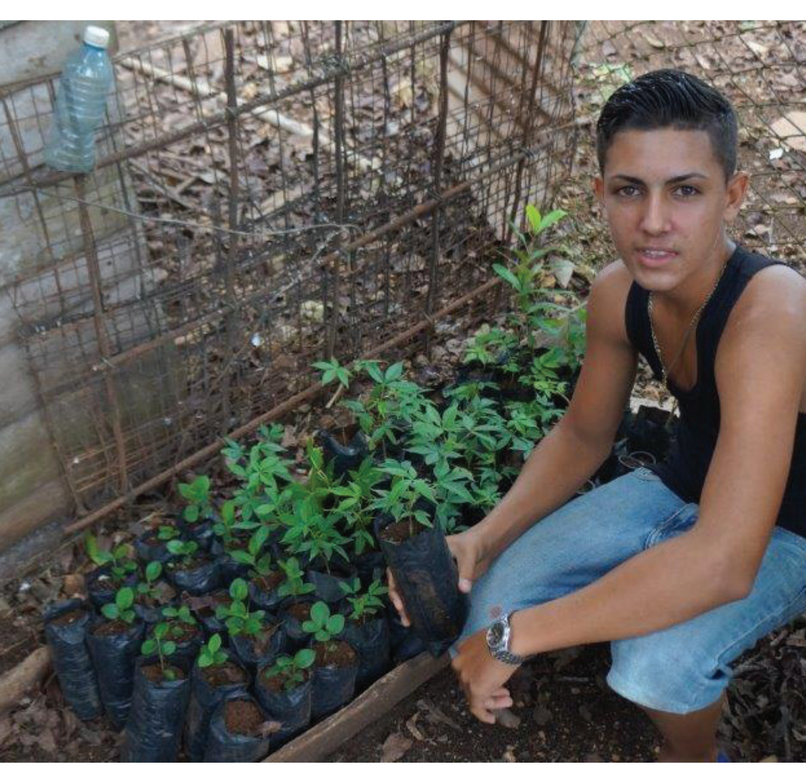
Young farmer planting mangrove. Youth are actively involved in mangrove planting and monitoring marine life on Cuba's coasts to help protect their communities from sea surges and flooding, through project funded by AF.