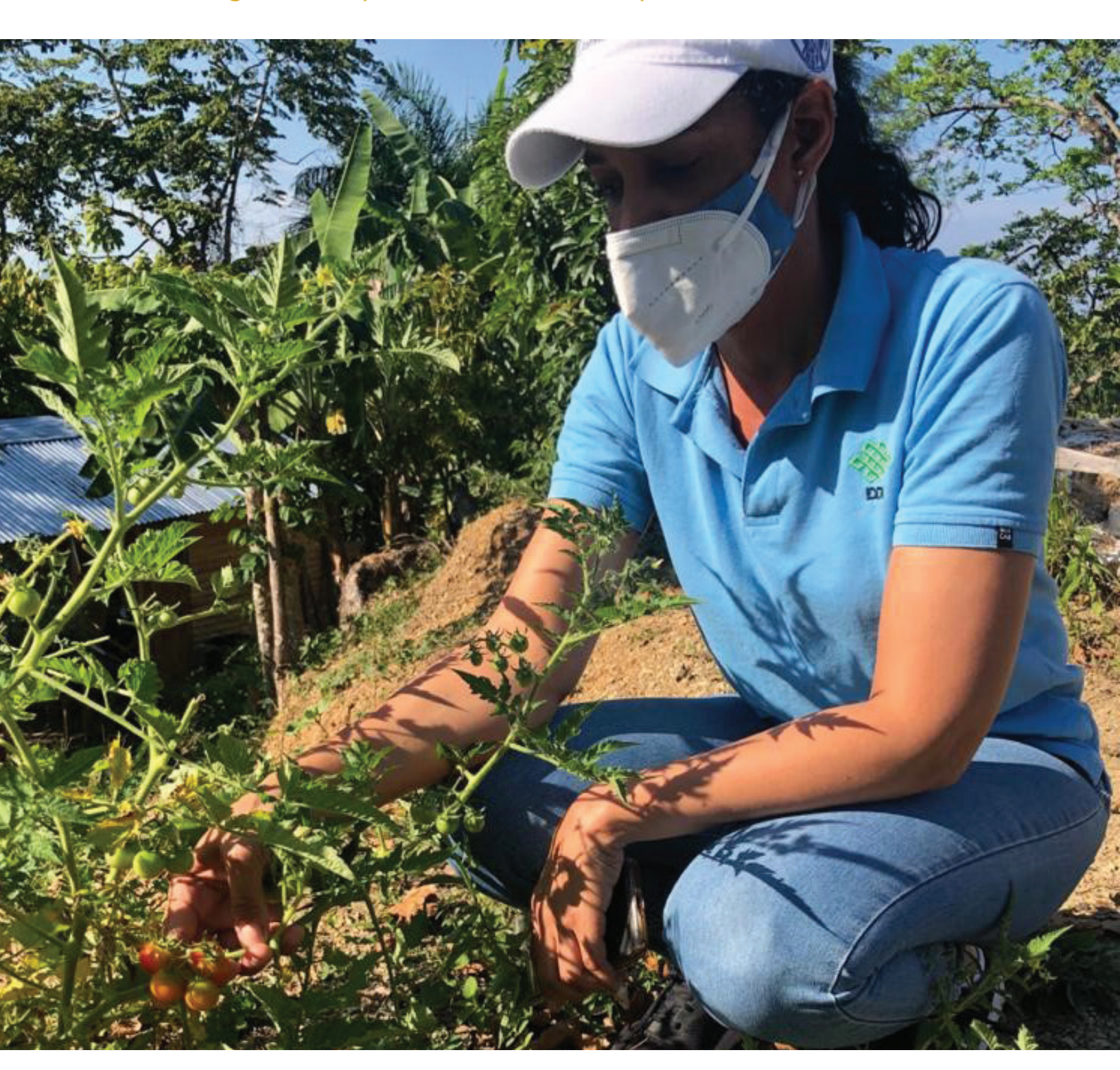
Project staff member supervising tomato and cocoa cultivation in the community of El Fundo, Province of San Cristóbal in Dominican Republic.

5.2.2 Dominican Republic – Enhancing Climate Resilience in San Cristóbal Province, Dominican Republic Integrated Water Resources Management and Rural Development Programme – Dominican Institute of Integral Development of Dominican Republic (IDDI) (US$9,953,692)