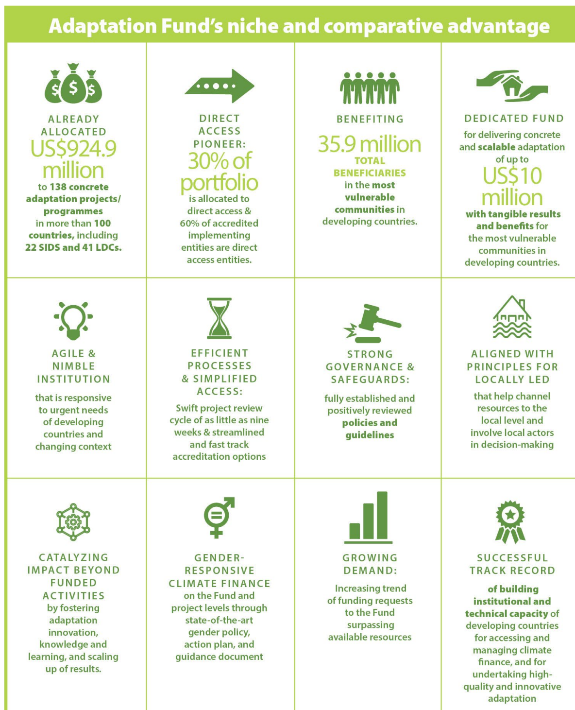
Illustration 4: Adaptation Fund's niche and comparative advantage