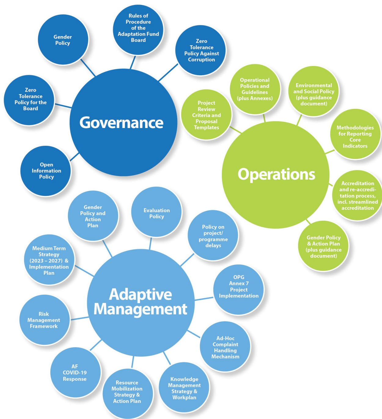
Illustration 6: Constellation of the Fund's existing policies, strategies and guidance documents