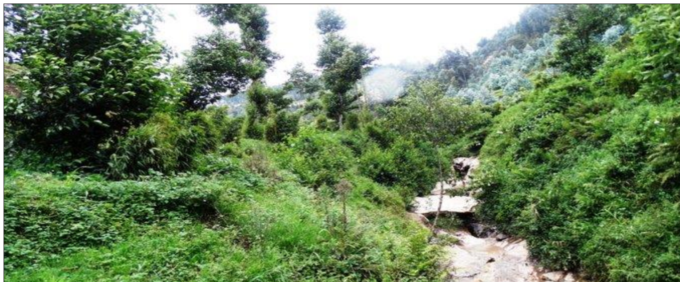
River bank protection with bamboo and alnus