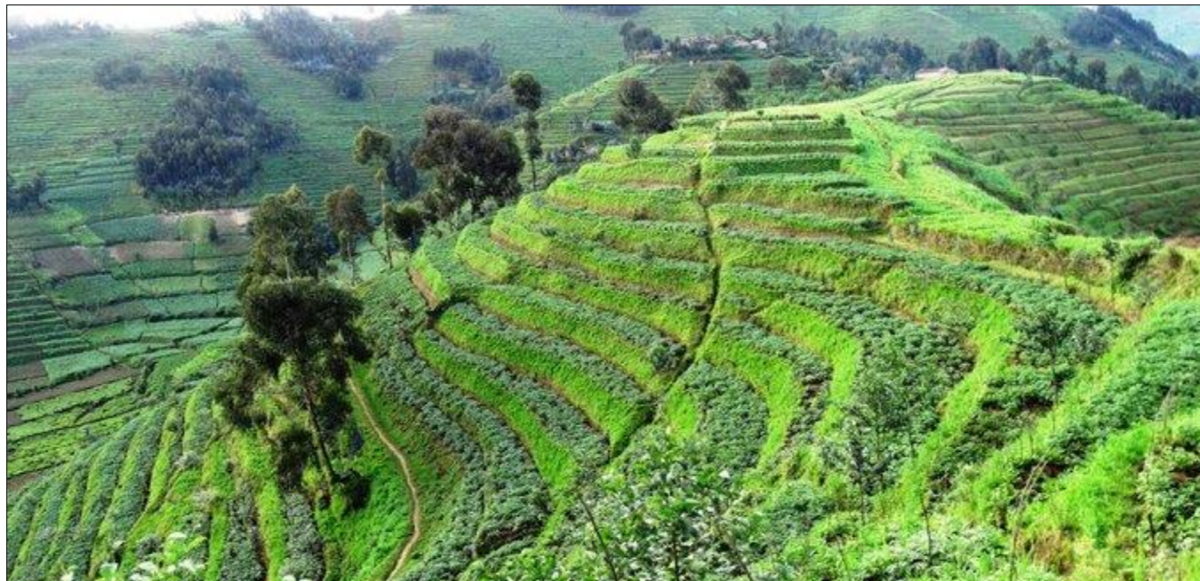
Bench terraces at Jenda site