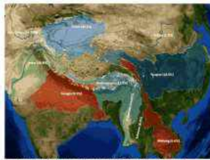
Figure 1. Predicted Percentage of Glacial Melt Contributing to Basin Flows in the Himalayan Basin.

Also, with increasing climate change impacts the region faces many other cryosphere hazards, including Glacier Surges (GSs), Glacial Floods (GFs), Glacial Collapses (GCs), Avalanches, and Ice Dammed Lakes along with the increased frequency of Glacial Lake Outburst Floods (GLOFs). The regional is also prone to glacial floods due to sudden draining of englacial water body, a phenomenon hard to monitor using technologies and predict. The Indus is highly dependent on the meltwater of the Hindu-Kush Himalaya, drawing nearly half its volume from these sources, more so than any other river in the region (see Figure 1).