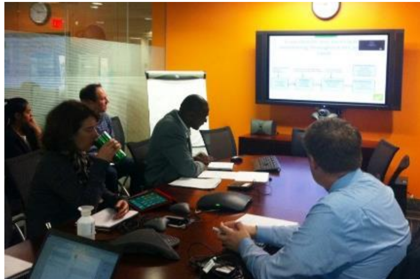
← ❖ Readiness webinars