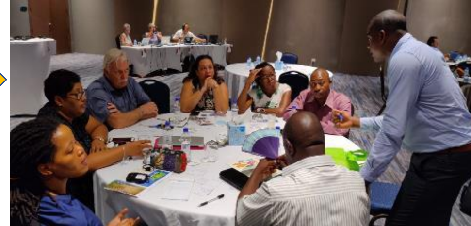
❖ Annual NIE seminar for accredited NIEs →