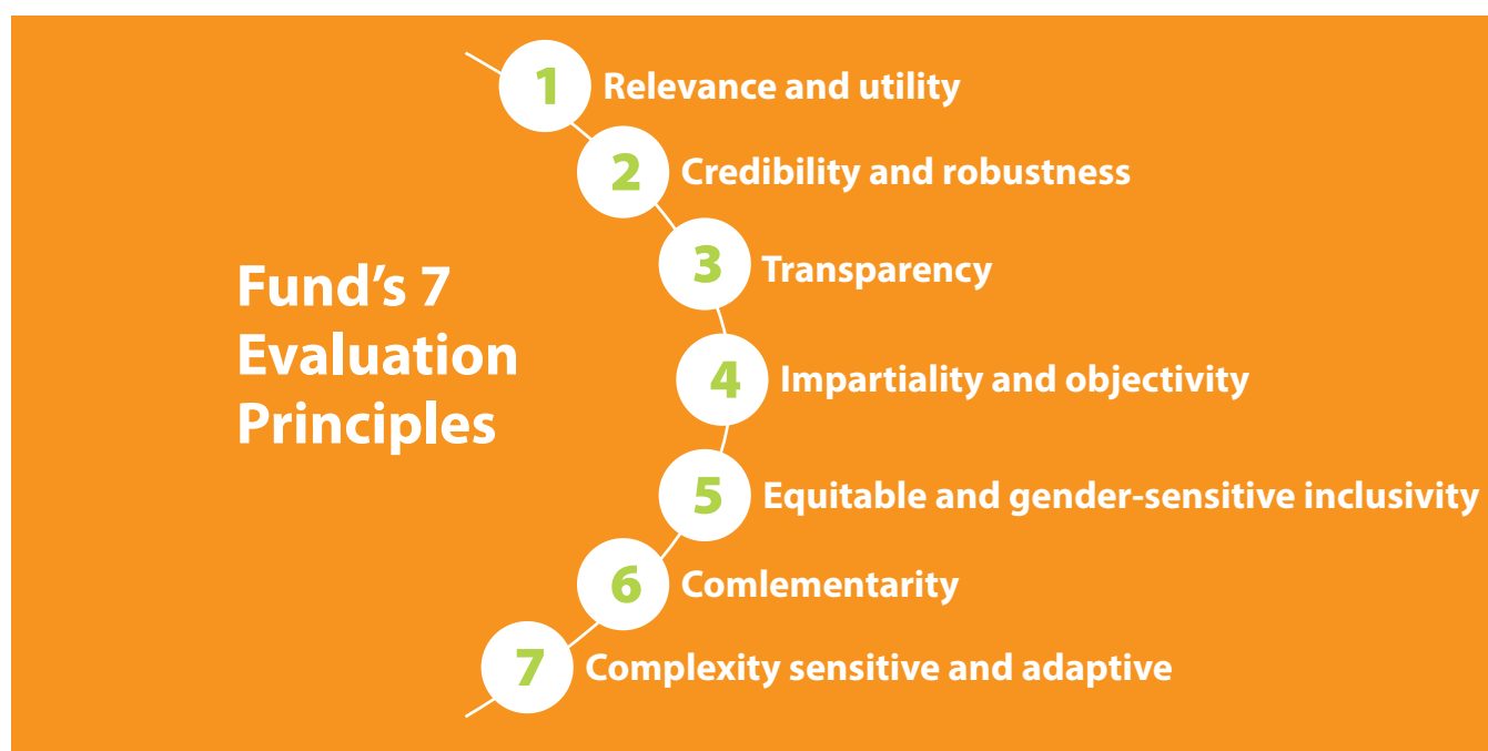
Figure 2: The Adaptation Fund's 7 Evaluation Principles

Three important points to note about the Fund's evaluation principles are: