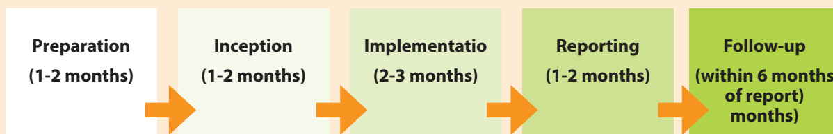
Figure 2: Illustrative MTR timeline

1) Preparation phase: Scope the evaluation, draft the Evaluation Management Plan, develop and disseminate the evaluations ToR (which provides an overview of what is expected the evaluation), recruit the evaluator(s).