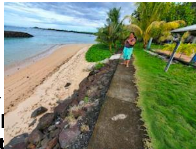
Samoa: Regina's Beach Fale after breaker (Nov '21)