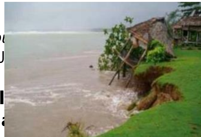
Samoa: Regina's Beach Fale after tropical cyclone