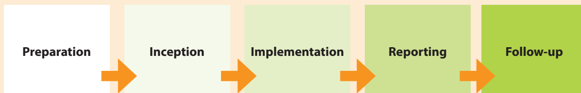
Figure 3: Illustrative final evaluation timeline

1) Preparation phase: Scope the evaluation, draft the Evaluation Management Plan, develop and disseminate the evaluations ToR (which provides an overview of what is expected the evaluation), recruit the evaluator(s).