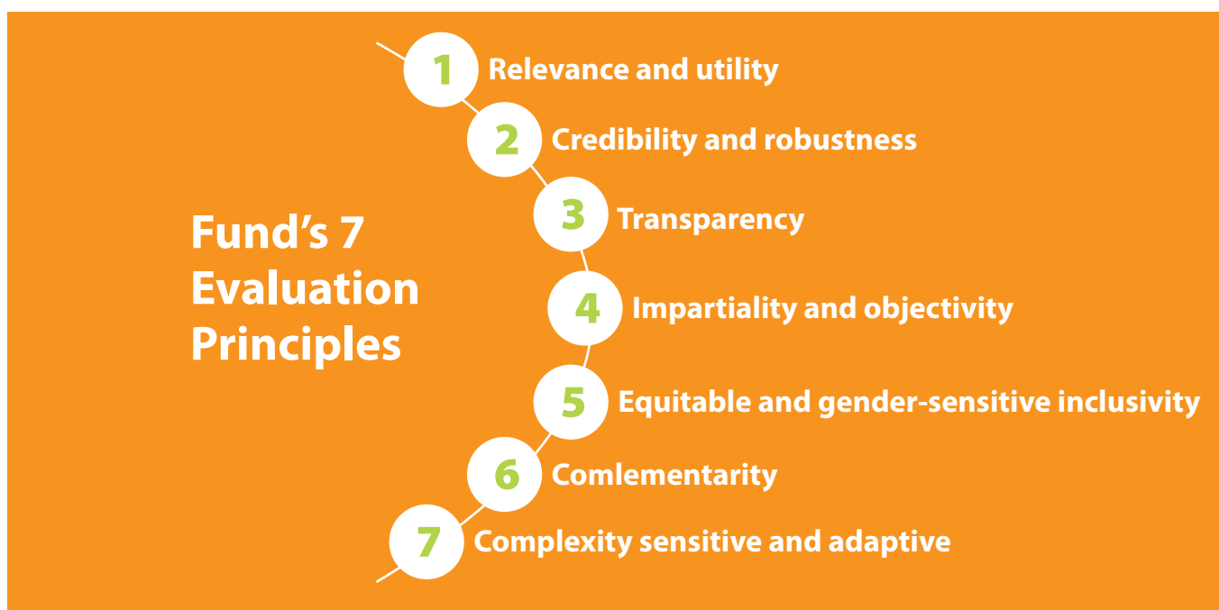
Figure 2: The Adaptation Fund's 7 Evaluation Principles

A critical aspect of both commissioning and managing and evaluation is ensuring that the evaluation exercise upholds the Fund's Evaluation Policy and its Evaluation Principles. The Evaluation Policy introduces seven evaluation principles that encompass the values, norms, and best practices to guide evaluation practice – see Figure 2 . Collectively, they ensure high quality fit-for-purpose evaluation processes and products, and support processes of