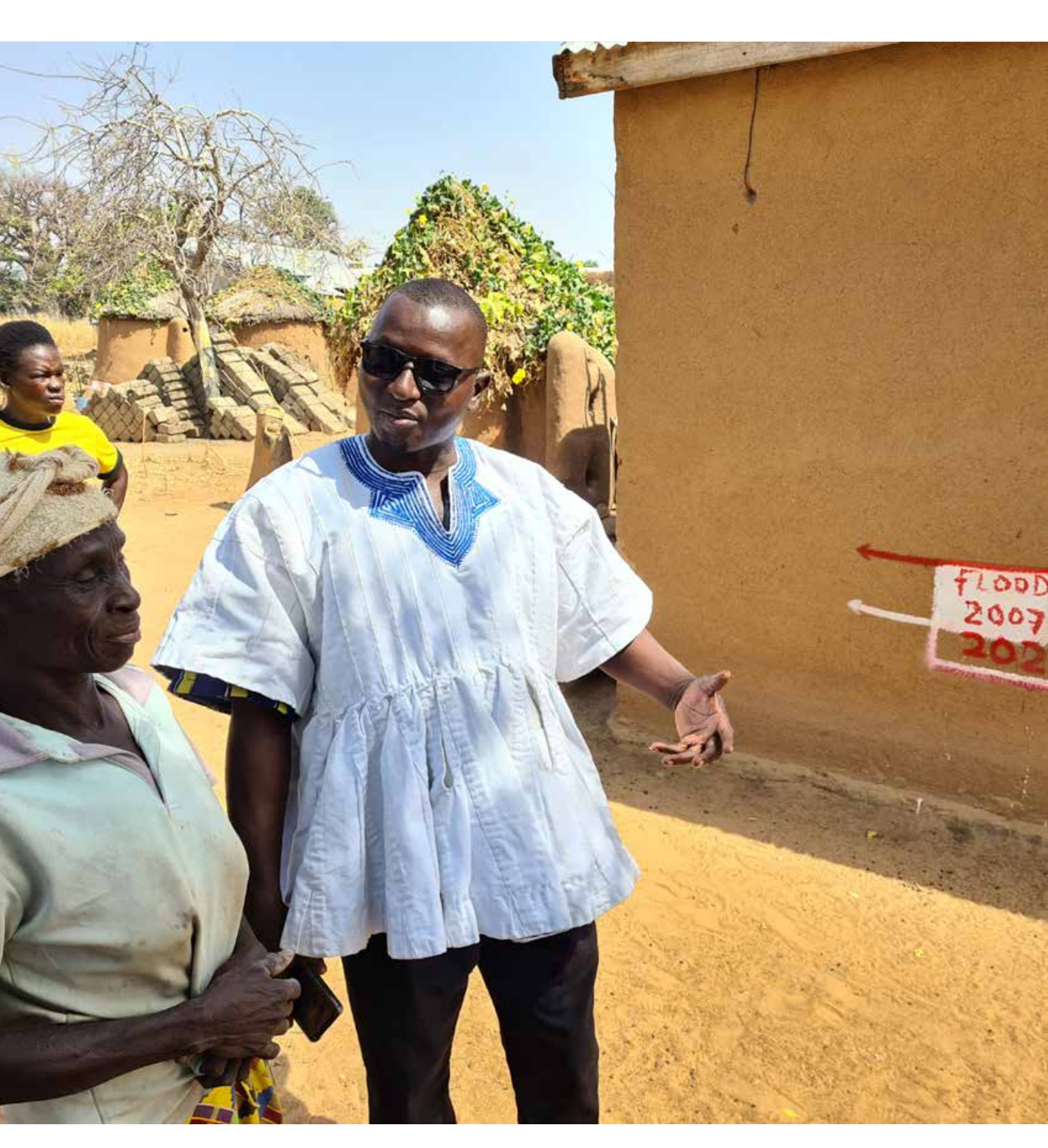
Flood water level markings are an important element of warning residents when they must evacuate their homes in Ghana.