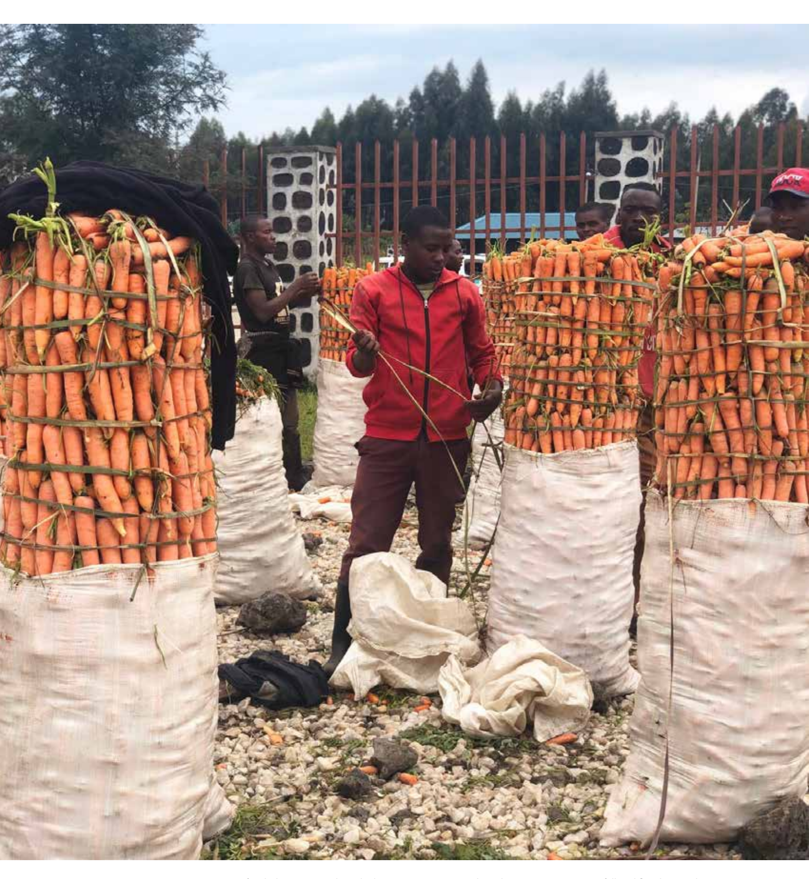
AF-funded community-based adaptation project aimed at adapting to extreme rainfall and flooding, and creating alternative livelihoods and training among young persons in Rwanda.