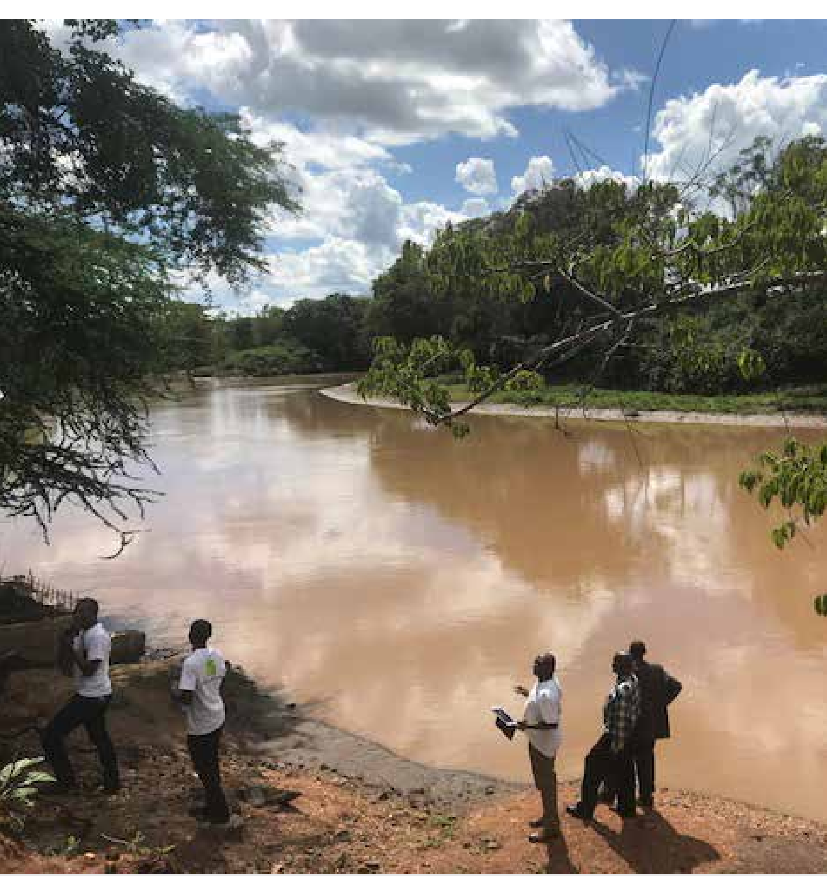
A village in Ghana uses river level markings to indicate when local communities should seek shelter.