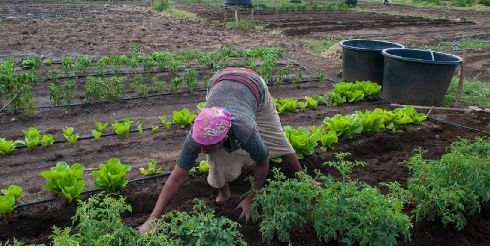
The use of elevated water storage tanks allows the efficient use of drip irrigation to combat drought in AF-funded project in Ethiopia.