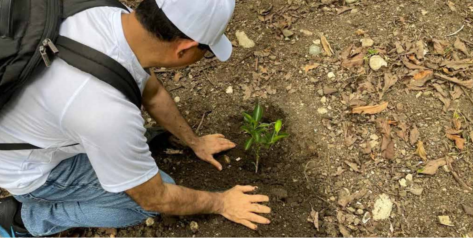
Communities adapting to drought and floods through improving water security and sustainable forest agricultural approaches in Dominican Republic.