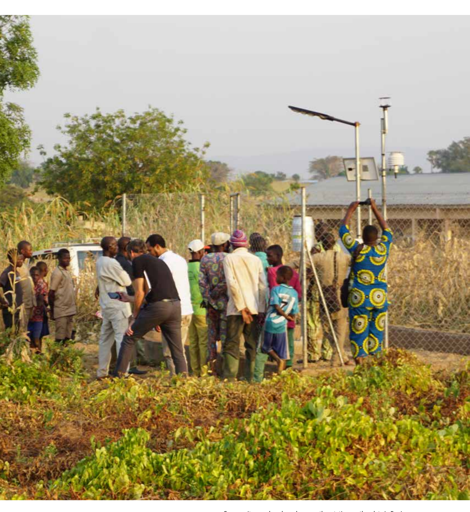
Community members learn how weather stations gather data in Benin