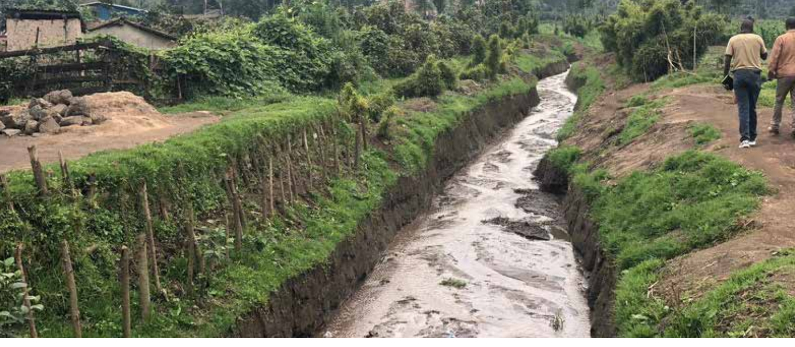
AF project in Rwanda is using agricultural terracing and improved drainage to help vulnerable communities adapt to flooding.

the specific circumstances of each region and promoting coordination, flexibility, and conflict sensitivity can advance climate resilience in conflict-affected and fragile settings.