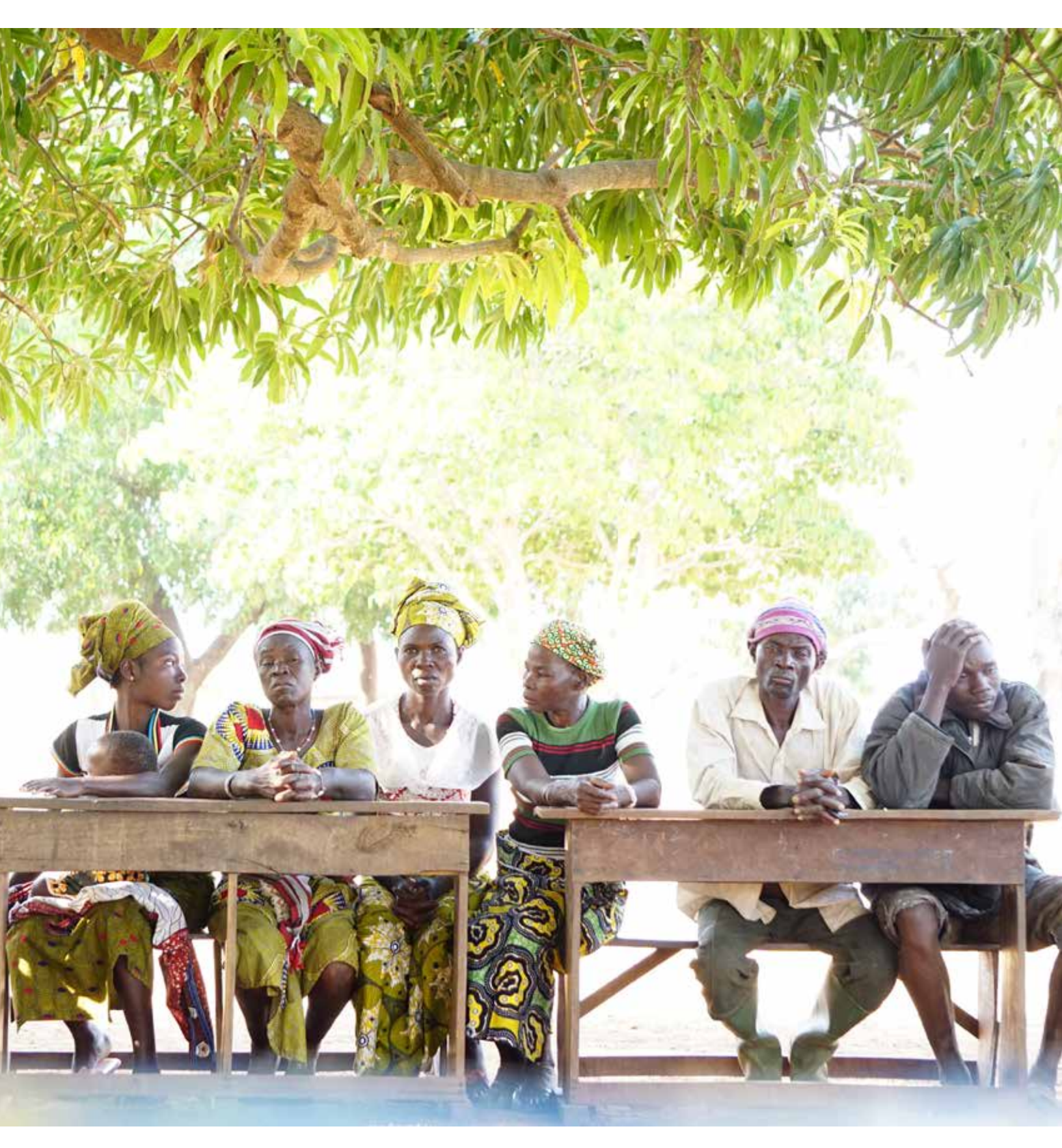
Stakeholder engagement meeting in Ghana.