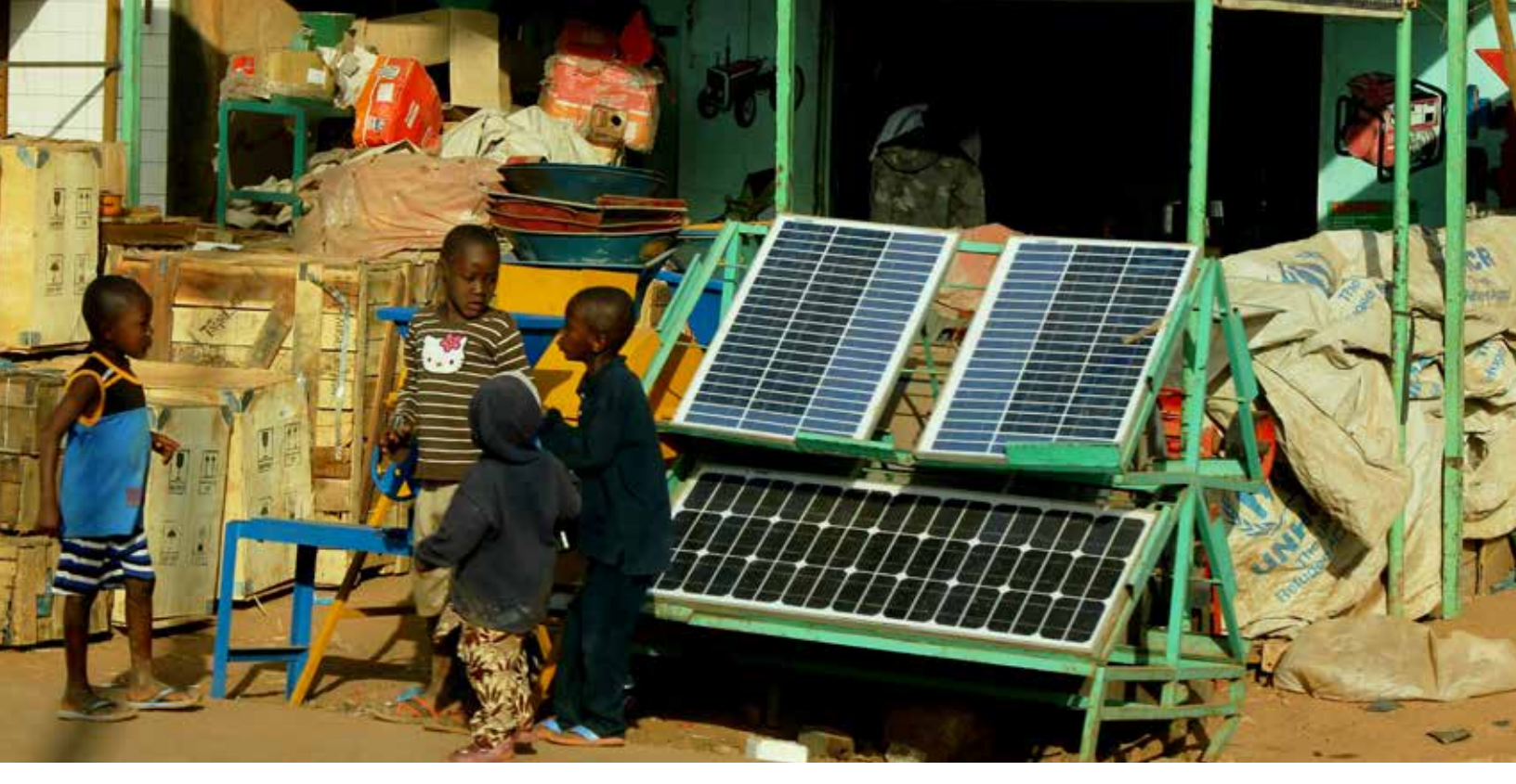
Solar panels in Ouagadougou, Burkina Faso. A picture chosen from AF Photo contest focused on the theme of "urban adaptation and resilience".

Syria Arab Republic: Increasing the climate change resilience of communities in Eastern Ghouta in Rural Damascus to water scarcity challenges through integrated natural resource management and immediate adaptation interventions