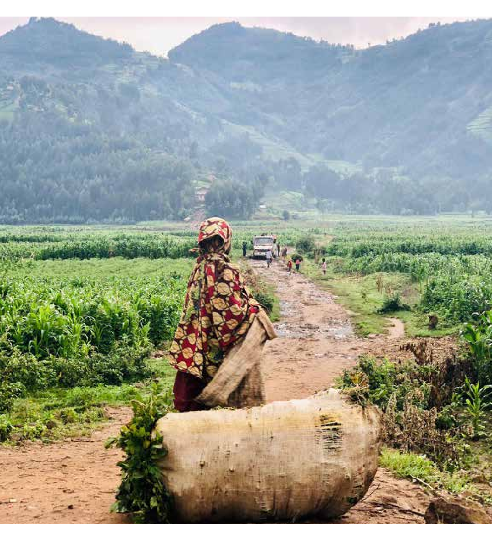
Increasing the adaptive capacity of natural systems and rural communities to climate change impacts in Rwanda.