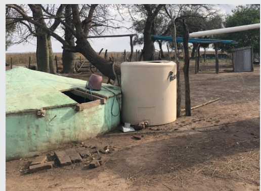
Cluster 6: Gancedo. Cistern without cover or funds for maintenance.

Schools benefit from the cisterns by improving water availability for students and staff. Both in Pampa Zanatta and Gancedo, teachers highlight the improvements they have seen in hygiene among their students and the availability of drinking water in the institutions. However, the maintenance of these cisterns (two in particular) remains in question, putting their benefits at risk. Funds from the Ministry of Education are intended only for a school's functioning, not for the maintenance of the cisterns. In addition, the school communities do not have the capability or the responsibility to maintain their cisterns. In Gancedo, the school's cistern lacks a cover, posing a danger to the children and to the water quality.