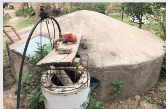
Cluster 2: Escuela “Dorila Labat.” Cistern with pump installed.

After the completion of the project, some farmers added enhancements to their cisterns for both water extraction and distribution. These enhancements include motor pumps instead of the original manual pumps, elevated water containers, and plumbing work within the buildings for water distribution and