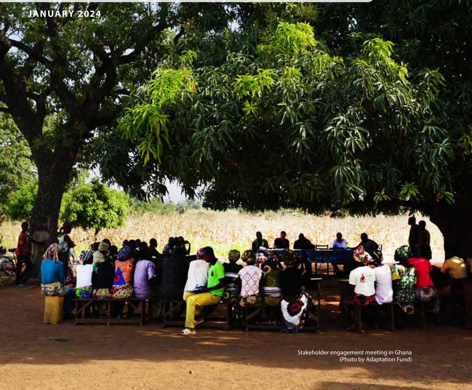
Stakeholder engagement meeting in Ghana