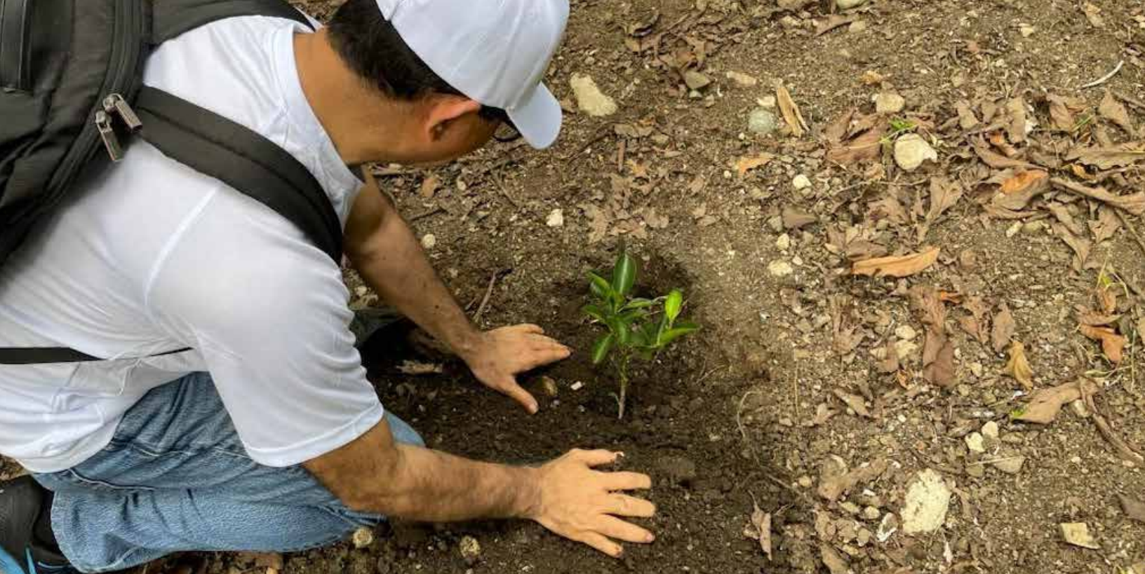
Communities adapting to drought and floods through improving water security and sustainable forest agricultural approaches in Dominican Republic.