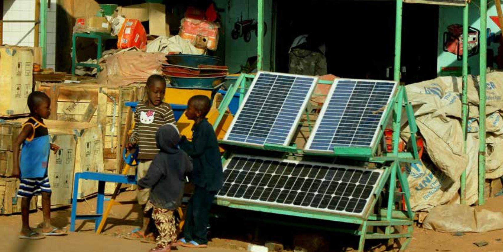
Solar panels in Ouagadougou, Burkina Faso. A picture chosen from AF Photo contest focused on the theme of "urban adaptation and resilience".