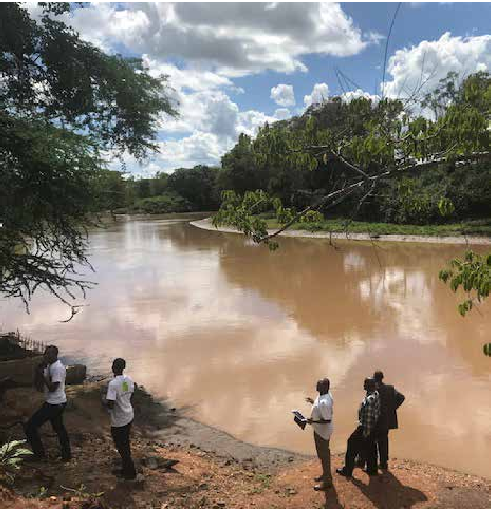
A village in Ghana uses river level markings to indicate when local communities should seek shelter.