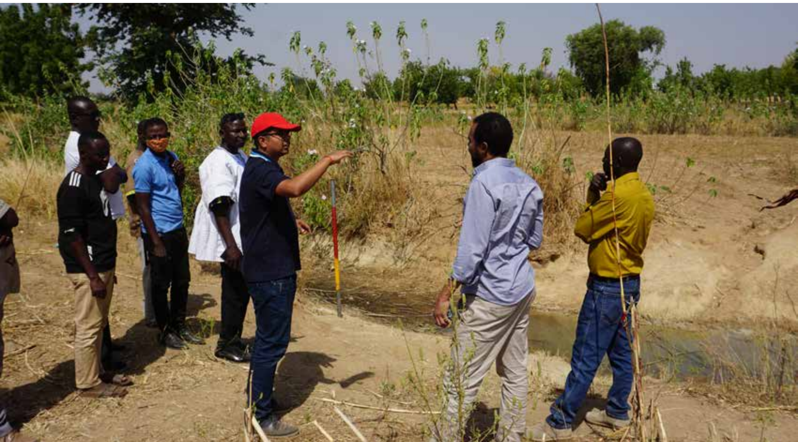
AF staff visit to drought-affected area in Ghana project where an integrated flood and drought management system is being developed.

adaptable to changing circumstances on the ground.