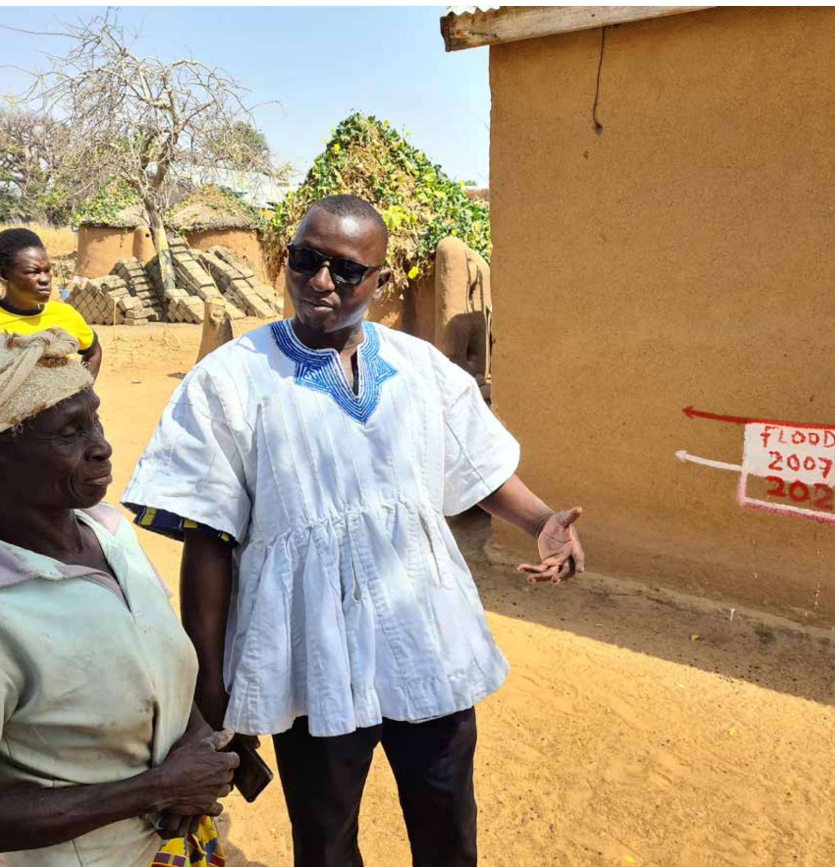
Flood water level markings are an important element of warning residents when they must evacuate their homes in Ghana.