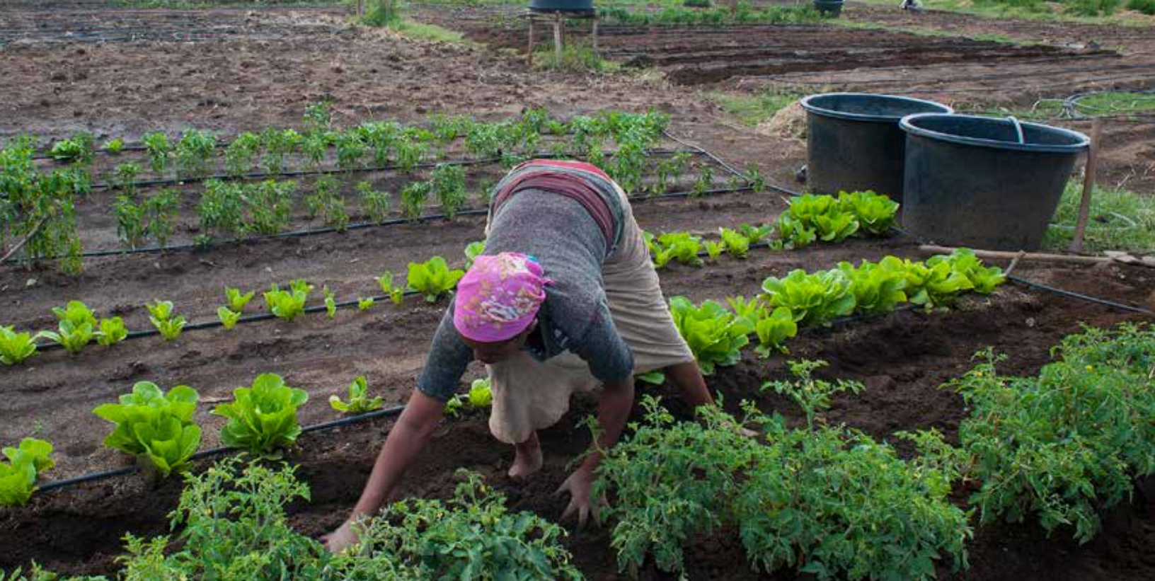
The use of elevated water storage tanks allows the efficient use of drip irrigation to combat drought in AF-funded project in Ethiopia.