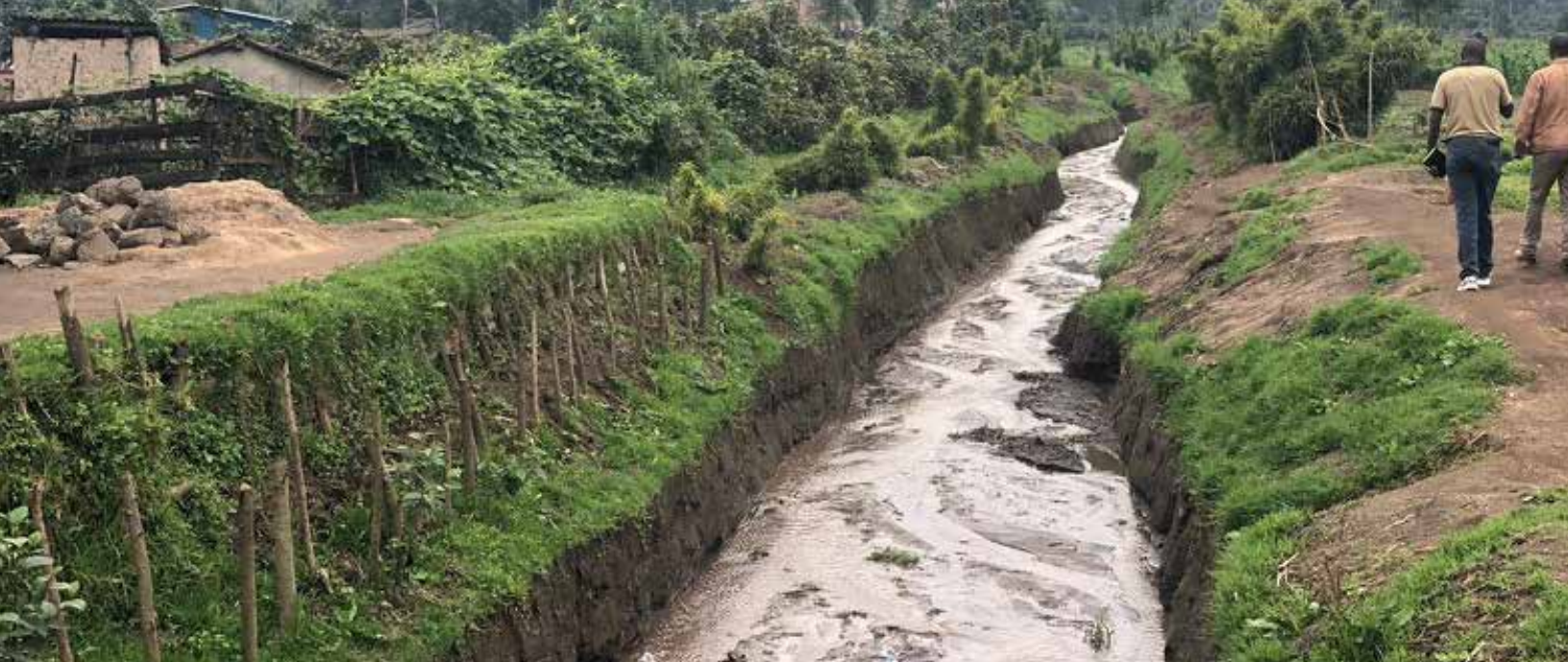
AF project in Rwanda is using agricultural terracing and improved drainage to help vulnerable communities adapt to flooding.

the specific circumstances of each region and promoting coordination, flexibility, and conflict sensitivity can advance climate resilience in conflict-affected and fragile settings.