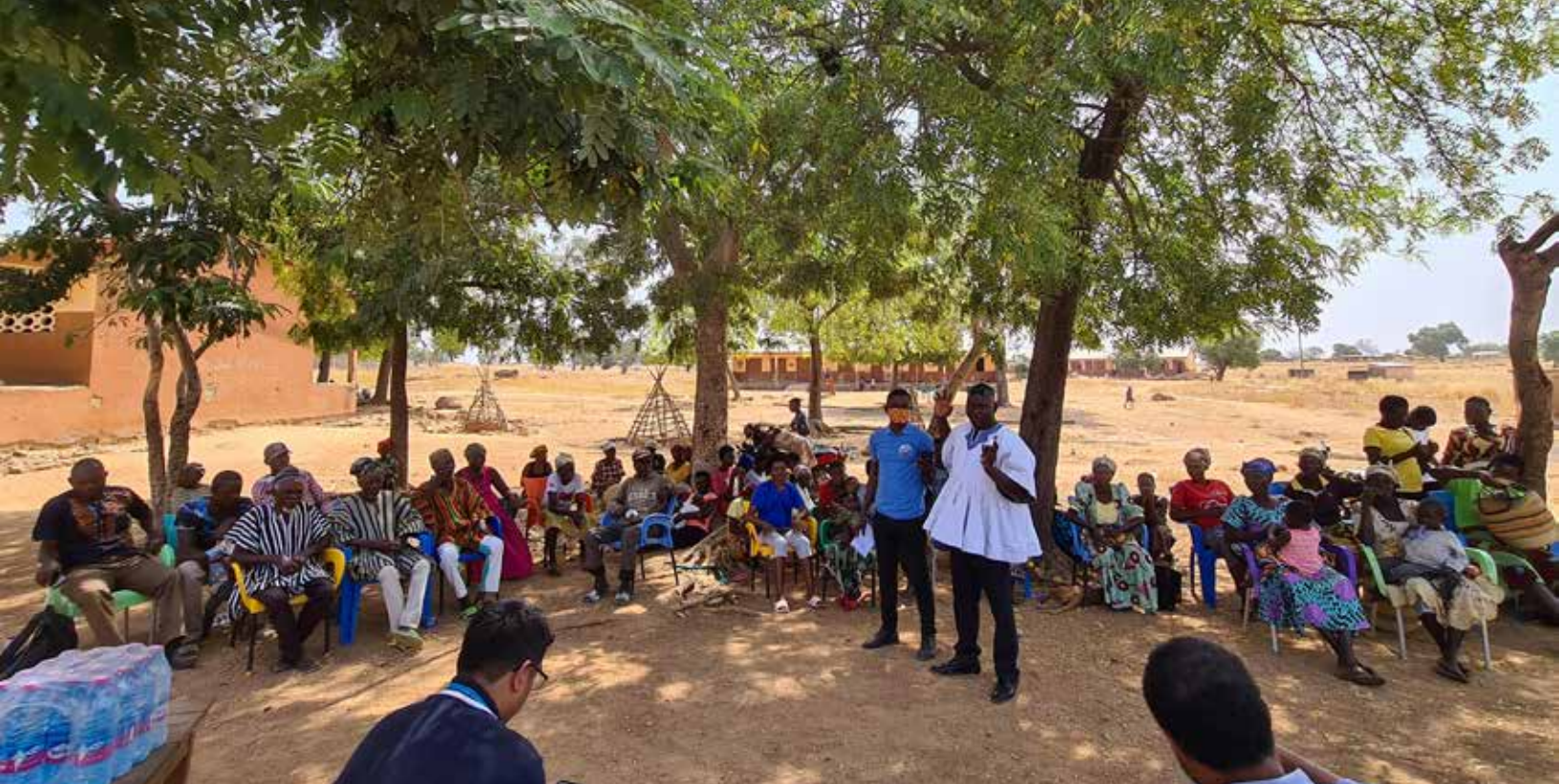
Engaging with project committee and community leaders in Benin.